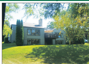
6.5 ACRE COUNTRY RETREAT Views over fabulous spring fed pond and hobby vineyard from a sun-filled spacious and gracious home with lower level at walkout. $799,000. Irislrwin.com