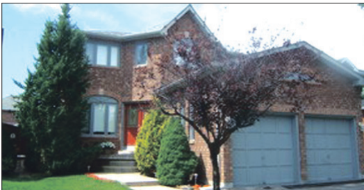
SPOTLESS 4 BEDROOM + LOFT! Great family home with new granite kitchen on quiet crescent. Shows superb! French doors, main floor family room & laundry, shingles 2010. Just move in! $489,000. Irislrwin.com