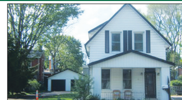
DOWNTOWN GUELPH Great century home updated with beautiful hardwood. 2 car detached garage on huge mature lot. $299,900. Irislrwin.com