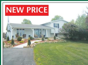
2+ ACRES WITH POND Gorgeous totally renovated open concept home with fabulous kitchen, gleaming hardwood floors and private mature lot. $499,000. Irislrwin.com