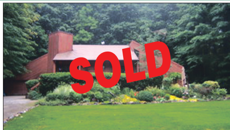
10469 SIXTH LINE