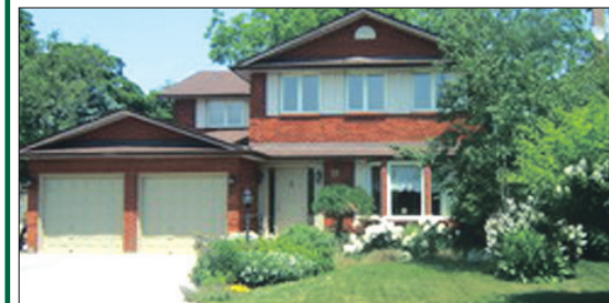
PARK AREA WITH INGROUND POOL! $559,000