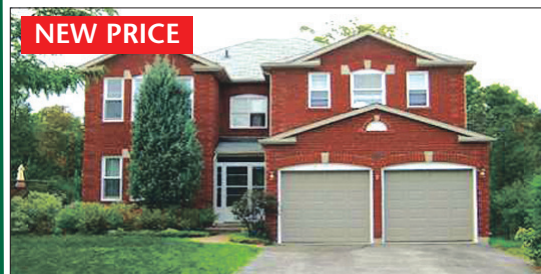
RAVINE IN GEORGETOWN SOUTH! Fabulous floor plan - 3330 sq. ft! Wow kitchen/family room combo with soaring ceiling and walkouts to deck with views over gorgeous ravine lot. Lower level at walkout!! $679,900. Irislrwin.com