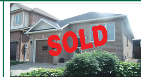
82 ATWOOD AVENUE