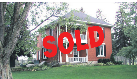
7166 25 SIDEROAD