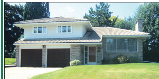
PRIME PARK AREA $539,000 Great location, quiet street. Well maintained custom stone and brick 3 bedroom home with quality oak kitchen, corian counter, updated windows, Marley roof, interlock drive and more. Irislrwin.com