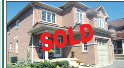
102 SNOWBERRY CRES.