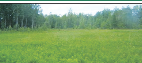
2 ACRE BUILDING LOT Lovely country lot in great Erin location. High and dry and just waiting for your dream home. $189,500. Irislrwin.com