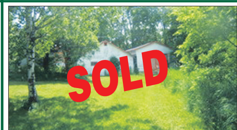
5680 WELLINGTON 23