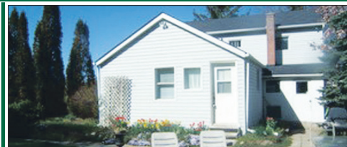
GLEN WILLIAMS - HUGE LOT Lovely setting! 3 bedroom home with large updated eat-in kitchen open to family room. Walk to Artisan's Village, Credit River and more. $319,000. Irislrwin.com