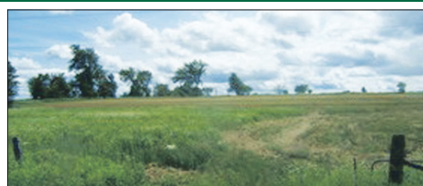
ERIN - 1 ACRE BUILDING LOT Pretty lot with nice views. Close to Village and only 45 minutes to Toronto. Build your dream home. $170,000. Irislrwin.com