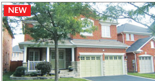
LUXURY LIVING IN STEWART'S MILL Immaculate open concept home with welcoming front porch and beautiful fenced yard with huge deck. Soaring ceiling in family room, gourmet kitchen, gleaming hardwood and finished lower level. $619,000. Irislrwin.com