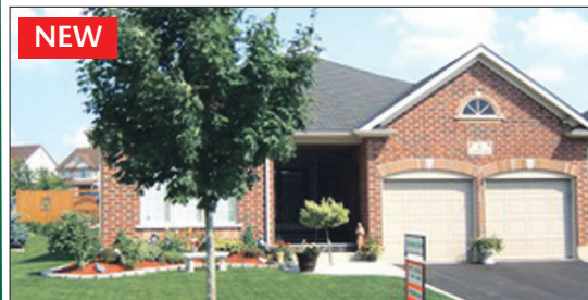
MAGNIFICENT CHARLESTON BUILT BUNGALOW Shows like a model home. Elegant wrought iron gates & covered front porch. Gleaming hardwood, granite counters, breakfast bar, vaulted ceiling, California shutters, finished lower level. Large fenced yard. $499,000. Irislrwin.com