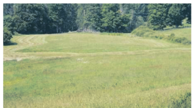
ALMOST 15 ACRES! $495,000 Kathy Ellis* 10-267-VL W1900068