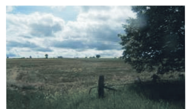
ERIN - 1 ACRE BUILDING LOT $170,000 Iris Irwin* 10-117-VL X1903811