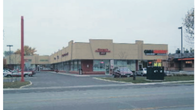
LOCATION! LOCATION! LOCATION! PresswoodTeam.com 10-238-30 W1881002