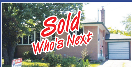
59 NORTON CRES., GEORGETOWN $310,000

Lovely 4+1 bdrm family home on quiet crescent. Nicely landscaped with a large deck & heated pool. Complete inlaw suite with private entrance. Great package. Great price.