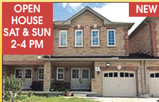
27 GOLDHAM WAY, GEORGETOWN

1% Total Commission Plan includes: Newspaper Advertising, Internet Advertising, Feedback, MLS, etc.