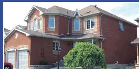
79 STANDISH ST., GEORGETOWN $539,000

Lovely 4+1 bdrm family home on quiet crescent. Nicely landscaped with a large deck & heated pool. Complete inlaw suite with private entrance. Great package. Great price.