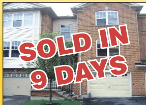
90 SEEDHOUSE LANE

RECENT GEORGETOWN FOR SALE & SOLD HOMES! More happy Home@Ease customers!