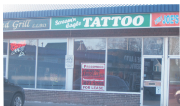
PRIME RETAIL - ON HIGHWAY 7 $15.00/SQ.FT.