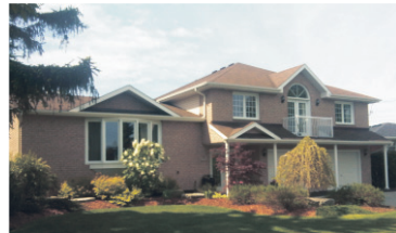
RAVINE LOT ON CUL DE SAC $899,900