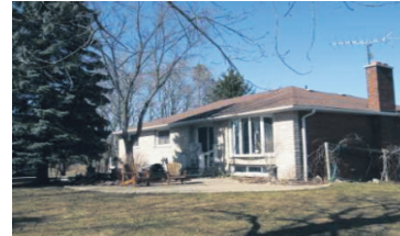
RAISED BUNGALOW ON 1.37 ACRES $549,900

Barry Cordingley*/Valerie Keslick* 10-219-30 W1921198