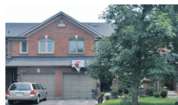
UPDATED BOLTON NORTH HILL TOWNHOUSE $314,000