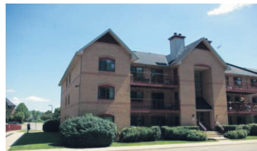
GREAT 3 BDRM CONDO-GREAT LOCATION $229,900