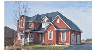
GORGEOUS UPGRADED HOME $679,000