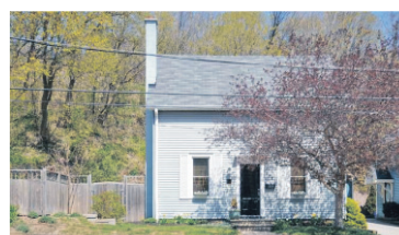
VILLAGE LIVING IN THE GLEN $409,500