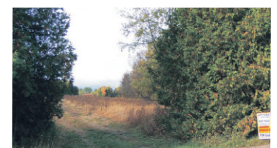
BUILD YOUR DREAM HOME $230,000