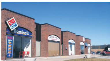
RETAIL SPACE-4 CORNERS OF GEORGETOWN