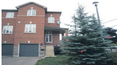
LOVELY END UNIT TOWNHOME $269,900