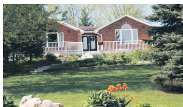
SUPERB INVESTMENT OPPORTUNITY $1,145,000