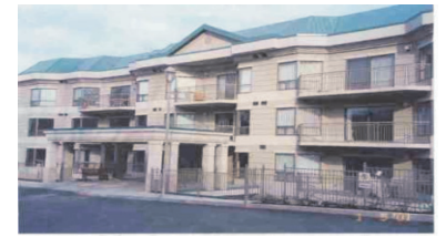
VICTORIA GARDENS PENTHOUSE $445,000