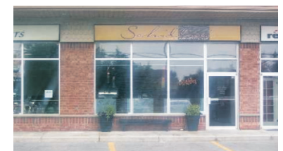
UPSCALE CAFÉ & EXPRESSO BAR $120,000