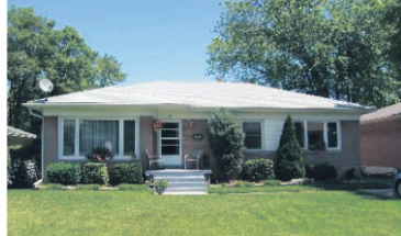
LARGER THAN IT LOOKS! $349,900