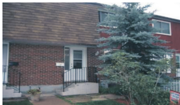
FAMILY SIZE TOWNHOUSE www.NUSHA.ca $172,500