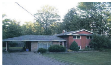
COMMUTERS TAKE NOTE! $439,900