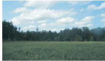
LOVELY 2.1 ACRE LOT $189,500