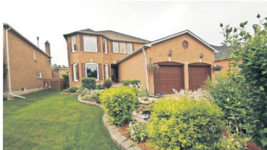
PROF FIN BSMT + POOL ON POPULAR STREET $548,000