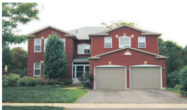
RAVINE ON GOLLOP! $679,000