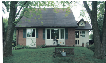
IT'S A CUTIE - INSIDE AND OUT $324,900