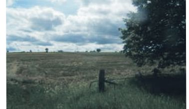
ERIN - 1 ACRE BUILDING LOT $170,000 Iris Irwin* 10-117-VL X1903811