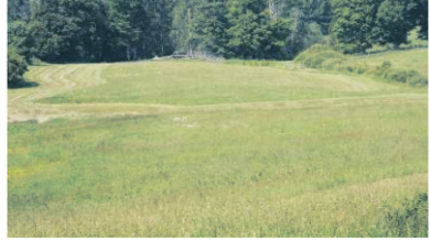
ALMOST 15 ACRES! $495,000 Kathy Ellis* 10-267-VL W1900068