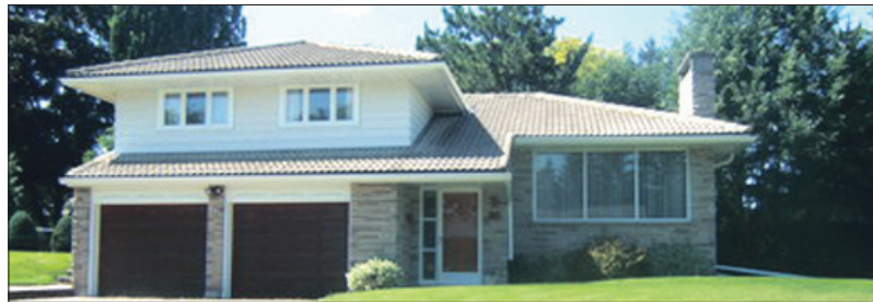
PRIME PARK AREA $539,000