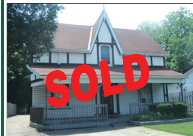
102 SNOWBERRY CRES.