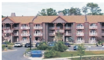
TIMESHARE IN HORSESHOE VALLEY $9,000