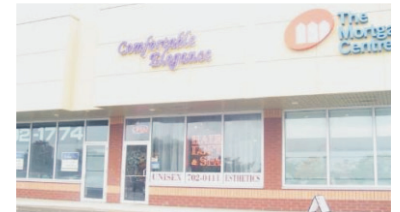
HAIR SALON/SPA FOR SALE $70,000