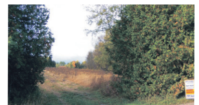
BUILD YOUR DREAM HOME $230,000