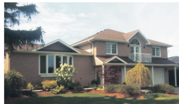
RAVINE LOT ON CUL DE SAC $949,900