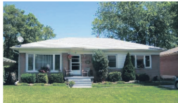
LARGER THAN IT LOOKS! $349,900