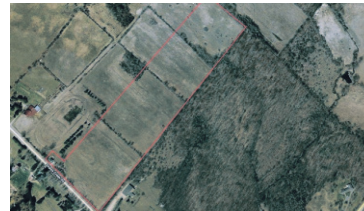
26+ BREATHTAKING ACRES $597,000