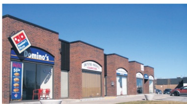
RETAIL SPACE-4 CORNERS OF GEORGETOWN