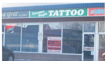
PRIME RETAIL - ON HIGHWAY 7 $15.00/SQ.FT.