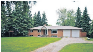
UPDATED BUNGALOW ON .85 AC $699,900