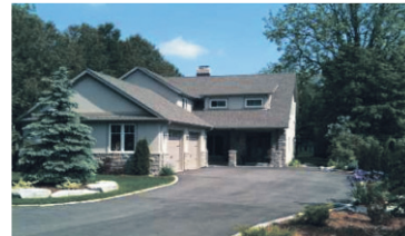
ONE OF A KIND - CUSTOM BUILT! $999,000

Barry Cordingley*/Valerie Keslick* 10-219-30 W1875773