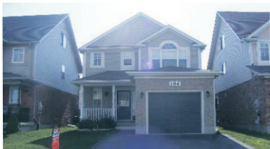
GORGEOUS 3 BEDROOM $299,900

Anna Lostritto* 10-004-VL/10-072-VL W1894345/W1901732