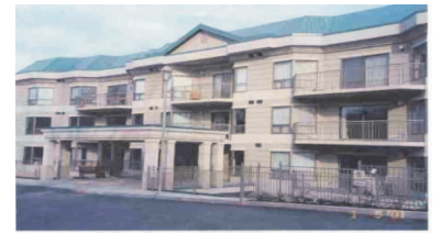
VICTORIA GARDENS PENTHOUSE $445,000