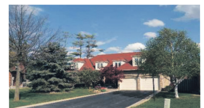
3000 SQ FT CAPE COD $599,900