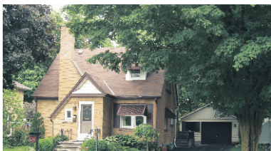
WALK TO THE GO $385,000