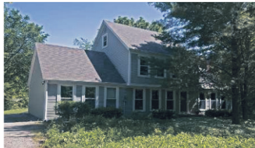
STUNNING-5 SPACIOUS BDRMS-MINS TO 401 $619,900