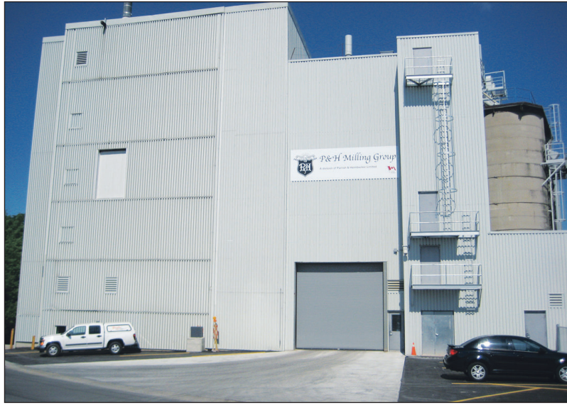
P & H Milling - Dover Flour - 45 Church Street West, Acton, Ontario L7J 1K1

The Acton plant is an integral part of their community and to see them coexist with their residential neighbours is proof of their dedication to their jobs and desire to continue to be an asset. They no longer have their store on site for smaller purchases, but their products can still be bought at the Flour Barrel Bulk Food store in Guelph. High customer and employee retention rates, Gold Standards, and quality products. These are just a few of the things that make this plant equal to none when they go that extra mile.