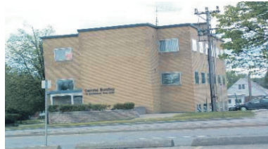
PROFESSIONAL SPACES AVAILABLE

It's easy for you to make good Real Estate decisions backed by your Johnson Associates agent's local knowledge and expertise.