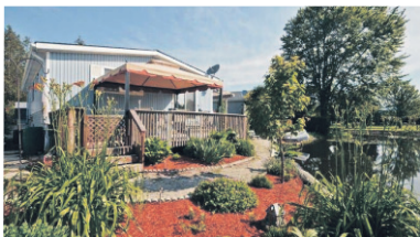
WATERFRONT - SEE WWW.WILLSSELL.CA $179,900