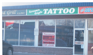
PRIME RETAIL - ON HIGHWAY 7 $15.00/SQ.FT.