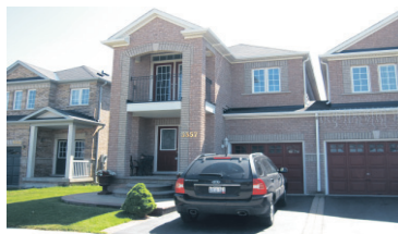
SEE WWW.WILLSSELL.CA! $424,900