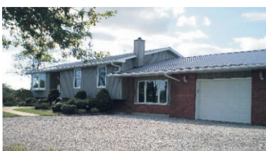
RAISED BUNGALOW FINISHED TOP TO BOTTOM $279,900