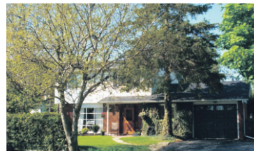
CAREFUL, IT'S LOADED! $319,900