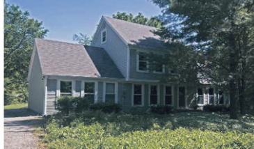
STUNNING-5 SPACIOUS BDRMS-MINS TO 401 $619,900