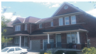
OPEN CONCEPT-CLOSE TO SCHOOLS/SHOPPING $424,900

Barry Cordingley*/Valerie Keslick* 10-254-99 W1894612