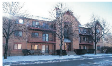
GREAT 3 BDRM CONDO-GREAT LOCATION $229,900

Chris* & Lee Gonchar* 10-210-31 W1872483