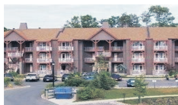
TIMESHARE IN HORSESHOE VALLEY $9,000