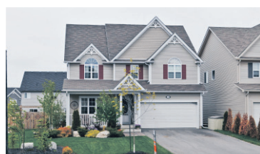
HUGE LANDSCAPED LOT $454,000