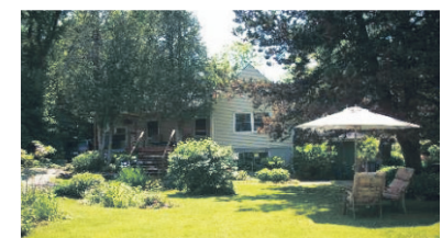
CHARMING BUNGALOW WITH LOFT $369,000