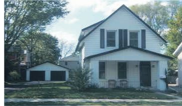
GUELPH - 3 BDRM & DBL CAR GARAGE $299,900

PresswoodTeam.com 09-164-30/09-277-30 W1862054/W1887467