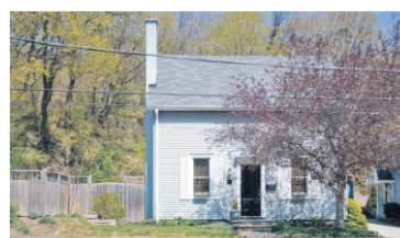
VILLAGE LIVING IN THE GLEN $409,500