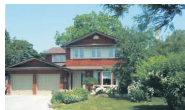
PARK AREA EXECUTIVE WITH POOL $579,000