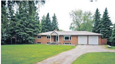
UPDATED BUNGALOW ON .85 AC $699,900