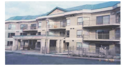
VICTORIA GARDENS PENTHOUSE $445,000