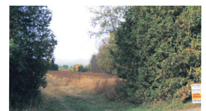
BUILD YOUR DREAM HOME $230,000