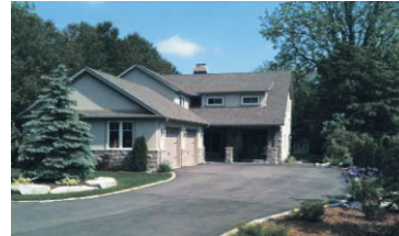
ONE OF A KIND - CUSTOM BUILT! $999,000

Barry Cordingley*/Valerie Keslick* 10-219-30 W1875773