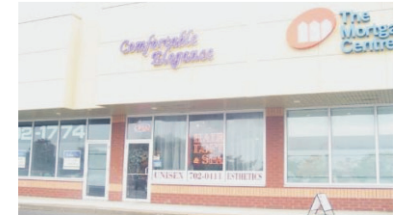
HAIR SALON/SPA FOR SALE $70,000