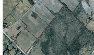
26+ BREATHTAKING ACRES $597,000