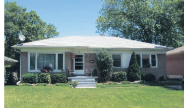
WELL MAINTAINED BUNGALOW W/LRG KIT $349,900

Barry Cordingley*/Valerie Keslick* 10-220-99 X1875819