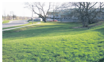
COMMERCIAL LAND ON HIGHWAY #7 & #25 $95,000