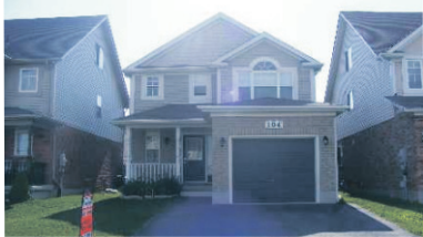
GORGEOUS 3 BEDROOM $299,900

Anna Lostritto* 10-004-VL/10-072-VL W1894345/W1901732