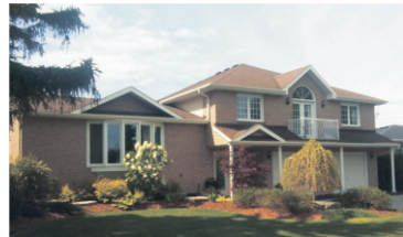
RAVINE LOT ON CUL DE SAC $949,900