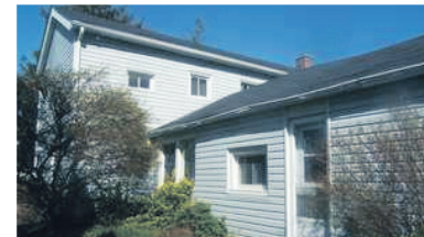
GLEN WILLIAMS - HUGE LOT $319,000