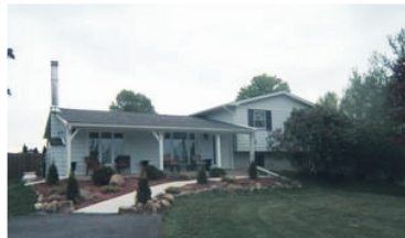
STUNNING HOME, POND, 2+ACRES $508,900