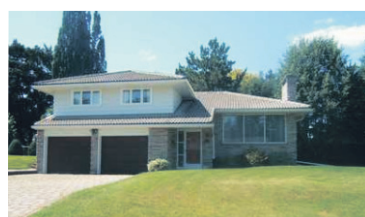
PRIME PARK AREA CUSTOM HOME $539,000