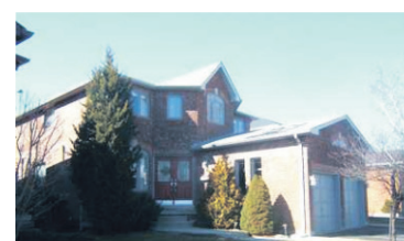
4 BDRM PLUS LOFT ON QUIET CRESCENT $489,000