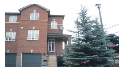
END UNIT TOWNHOME! $269,900