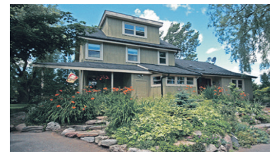
4 BDRM OVERLOOKING POND IN ERIN $434,000