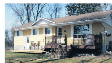
BEAUTIFUL UPDATED HOME ON 5 ACRES $395,000