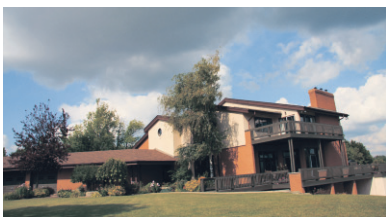
10AC PROP. ON ESCARPMENT-AMAZING VIEWS $1,595,000