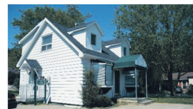
BUS./INVEST. OPPORTUNITY - ERIN $324,800