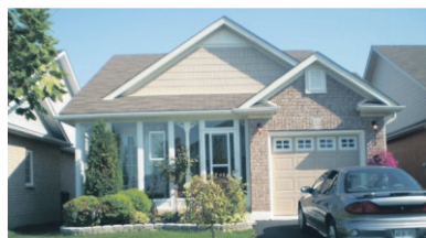
VIRTUAL TOUR @ www.willsell.ca $324,900