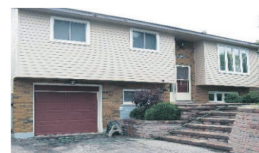
IMPECCABLE IN & OUT - monicak.ca $329,900