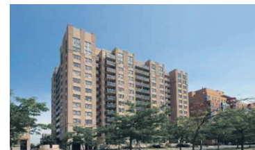
HEART OF LAKESHORE VILLAGE $221,900