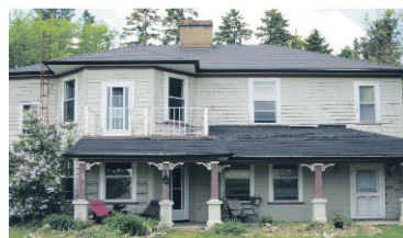
FANTASTIC OPPORTUNITY $289,000