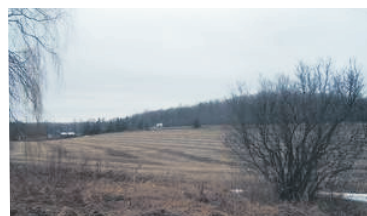
ERIN 98+ ACRE WORKING FARM $800,000