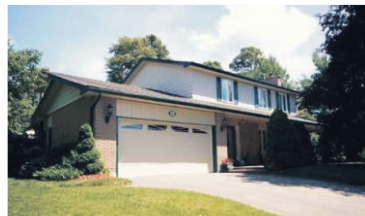
IT'S WORTH THE DRIVE TO ERIN! $494,900