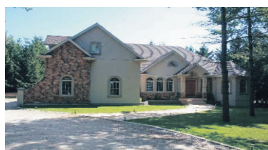
IMPECCABLE TASTE & QUALITY! $799,800