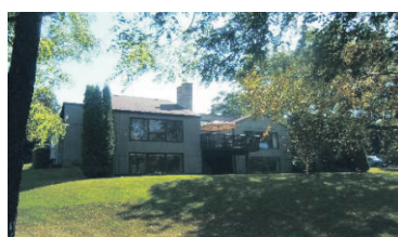
6.5 ROLLING ACRES WITH POND $799,000