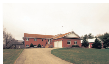
10 ACRES WITH WORKSHOP $585,000