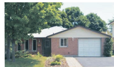
3 BDRM BUNGALOW IN GUELPH $274,900