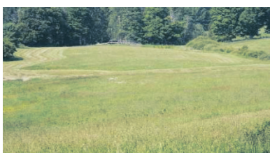
ALMOST 15 ACRES $495,000