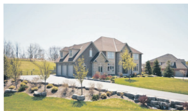
EXQUISITE CUSTOM HOME $1,595,000

For more detailed information, call a Johnson Associates Real Estate Professional.