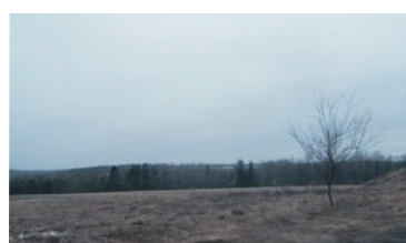
ERIN - 1 ACRE BUILDING LOT $170,000