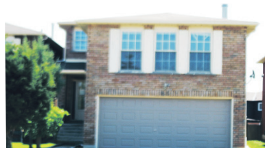
DETACHED HOME W/GREAT FLOOR PLAN $384,900