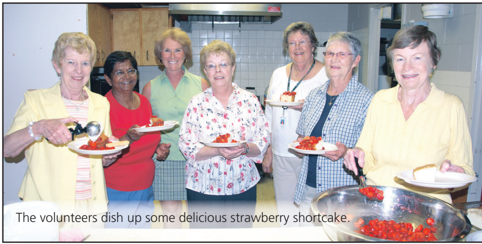
The volunteers dish up some delicious strawberry shortcake.