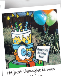
He just thought it was the coolest thing.