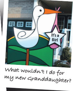
What wouldn't I do for my new granddaughter?