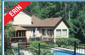
ERIN 2.3 ACRES NATURAL AND FORESTED - ERIN $685,000 Truly a wonderful location on a quiet Cul-De-Sac. Beautiful inground pool, hot tub in gazebo, total privacy in a quiet mature country neighbourhood. Beautifully maintained and updated. Bonnie Sturgeon*, Sales Rep