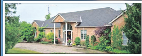
NOT YOUR AVERAGE FARMHOUSE! $1,180,000 MIKE KRAUSE* www.krausefamily.ca