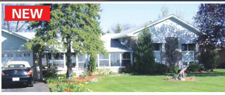
NEW TEE OFF AT HOME! $634,000 Well practically! Walk out from your backyard onto the golf course. MARY LAW* OF THE DESJARDINS TEAM