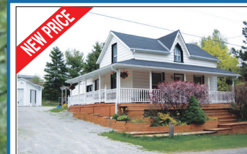
NEW PRICE "GRANDMA'S HOUSE" ONLY $294,900 Great Starter or Retirement Home in Hillsburgh, close to all amenities. Cute as a button with wrap-around porch, oversized single garage and three bedrooms. Norinne Kilgour, Sales Rep.