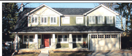
ONE-OF-A-KIND PARK DISTRICT MASTERPIECE GUARANTEED TO PLEASE $789,900 MARIANA HRKAC* OF THE HRKAC TEAM