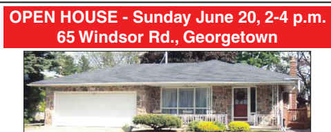
OPEN HOUSE - Sunday June 20, 2-4 p.m. 65 Windsor Rd., Georgetown CUSTOM 3 BDRM, 4 LEVEL BACKSPLIT $459,999 with 2 car garage, updated kitchen w/ceramic and hardwood floors, 2 fireplaces, mature landscaped yard. TAMMY KUDLIK*