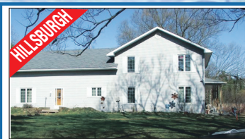
HILLSBURGH LARGE 5 BEDROOM FAMILY HOME $360,000 Overlooking beautiful view of Roman Lake. 2 kitchens, 3 washrooms, hardwood flrs, main flr laundry, septic, roof, windows and most of the home about 9 years old and with a few finishing touches you will have a real gem on a great piece of property (one of a kind). Liz Crighton, Sales Rep