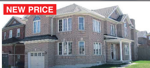
NEW PRICE IN GEORGETOWN SOUTH $489,900 ERIN GOGAN*