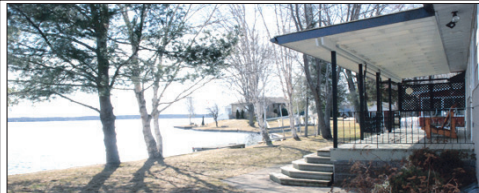
LAKEFRONT PROPERTY $539,000 Great home on Couchichinguis with lots of room for guests & the family. Finished basement with a house and more. SOLD NORINNE KILGOUR*