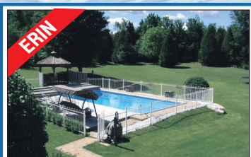
ERIN LIFESTYLE OPTIONS YOU CHOOSE $564,900 12 Acre country oasis with inground pool, a work-from-home office for two or easy potential for extended family/in-law suite. Any or all can be accommodated here! Steve White* www.stevewhitehomes.com