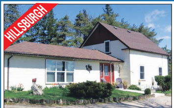
HILLSBURGH * RARE FIND * 97 ACRE FARM NEW PRICE $699,900 East Garafra, Livestock not included. Barn 4 yrs young + Country Farm House. 4 Bedrooms, 2 Washrooms, New Windows. Fronting Paved Hwy 24. 5 min. North of Hillsburgh. Joanne Gardner*, Sales Rep.