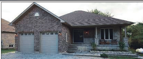
CUSTOM EVERYTHING $564,900 MELISSA KRAUSE-CARDILLO* www.krausefamily.ca