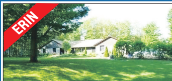
ERIN WHAT MORE COULD YOU WANT $899,000 When you've got everything right here? Gorgeous country estate on 5 acres. $$ spent on upgrades! 4 beds, 2.5 bath, solarium open to kitchen, family room, sunroom, main floor laundry, finished bsmt with rec + games rooms, large detached heated workshop with garage door opener + remote, wood shed, garden shed, huge pond, trees, professionally landscaped perennial gardens and the exquisite country setting you've been dreaming of! www.al-liz.com aeroplan Melodie Rose, Sales Rep.