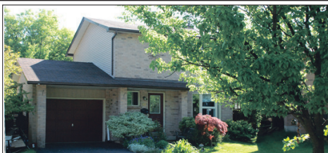
BEAUTIFUL 3+1 BEDROOM HOME - ACTON $314,900 STEVE FONTANNA*

~ The Centre For All Your Real Estate Needs ~ To see more of our numerous listings, please visit www.remaxcentre.ca