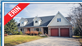
ERIN COUNTRY STYLE CAPE COD $529,000 Is on just over 1/2 an acre lot in town backing onto nature with stream running through and lovely mature trees. Spacious and bright home, large entrance foyer, main floor laundry, updated eat-in kitchen with W/O to large 2 tier deck and totally private yard. 3 updated bathrooms, 3 generous size bedrooms and huge loft over 4 car garage ready to finish. Quiet cul-de-sac within walking distance to town. Joanne Gardner*, Sales Rep.