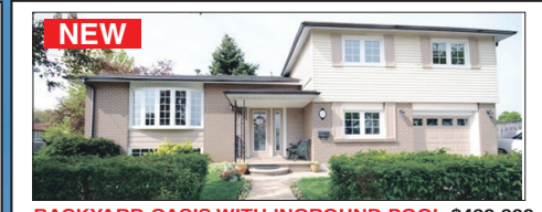
NEW BACKYARD OASIS WITH INGROUND POOL $439,800 Outstanding home on a 133 ft. by 73 ft. premium lot with 6 year old inground pool. Stunning new kitchen, refinished hardwood, carpet in the family room in 2010. Extensive renovations inside and out. A MUST SEE! JIM LEGERE*