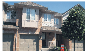
BEAUTIFULLY DECORATED TOWNHOUSE $295,900