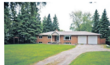
UPDATED BUNGALOW ON .85 ACRE $699,900