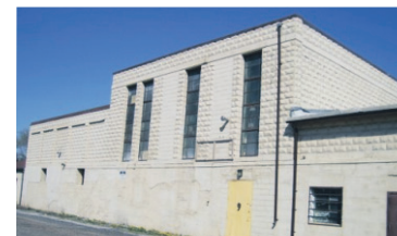
INDUSTRIAL UNIT IN HEART OF GEORGETOWN $319,000

David Burland*/Nusha Mathieson* 10-168-30 W1844823