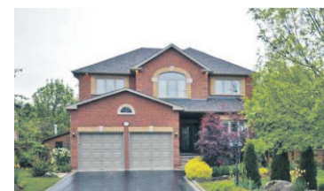
FIRST TIME OFFERED $899,900