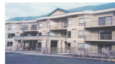
VICTORIA GARDENS PENTHOUSE $445,000