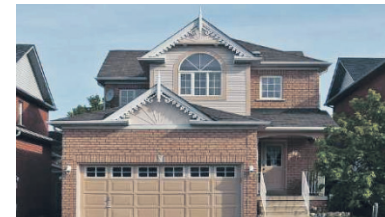
3+1 BDRM WITH FINISHED BASEMENT! $399,900

Chris* & Lee Gonchar* 10-208-30 W187244E