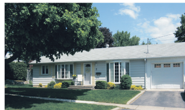
DESIRED LOCATION - CLOSE TO RAVINE $339,500

PresswoodTeam.com 09-515-30/10-238-30 W1881002/W1885139