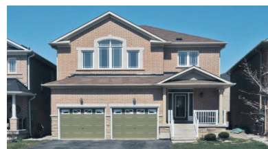
BEAUTIFULLY MAINTAINED 3+1 BDRM $424,900