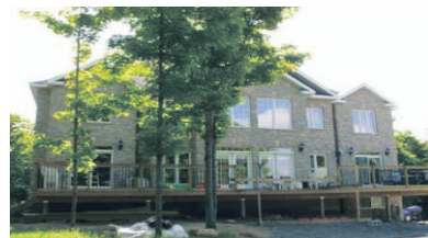
BEAUTIFUL OPEN CONCEPT ON APPRX 10ACS $399,900