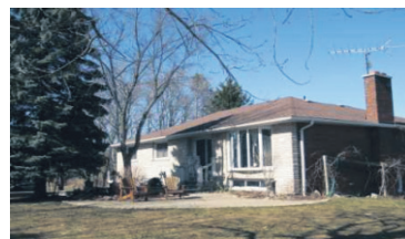
1200 SQ FT OUTBUILDING + IN-LAW + + $579,900