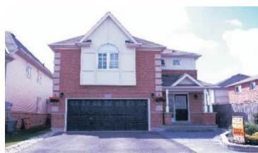
BEAUTIFUL - QUIET AREA OF TOWN $499,900