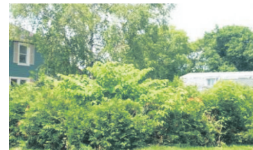
SUPERB BUILDING LOT $104,900