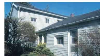
GLEN WILLIAMS - HUGE LOT $319,000