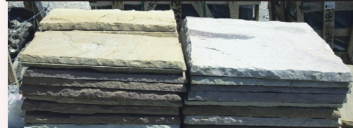
Square Cut Flag