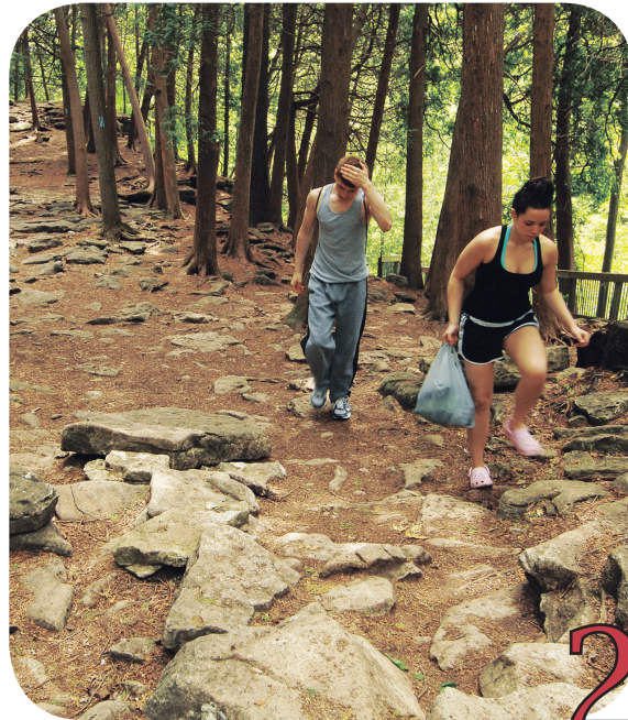
Exploring Hilton Falls