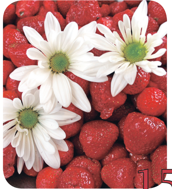
A berry good time