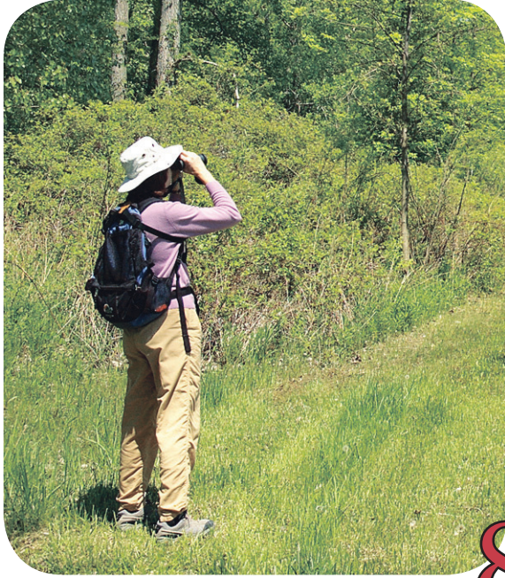
Take a hike!