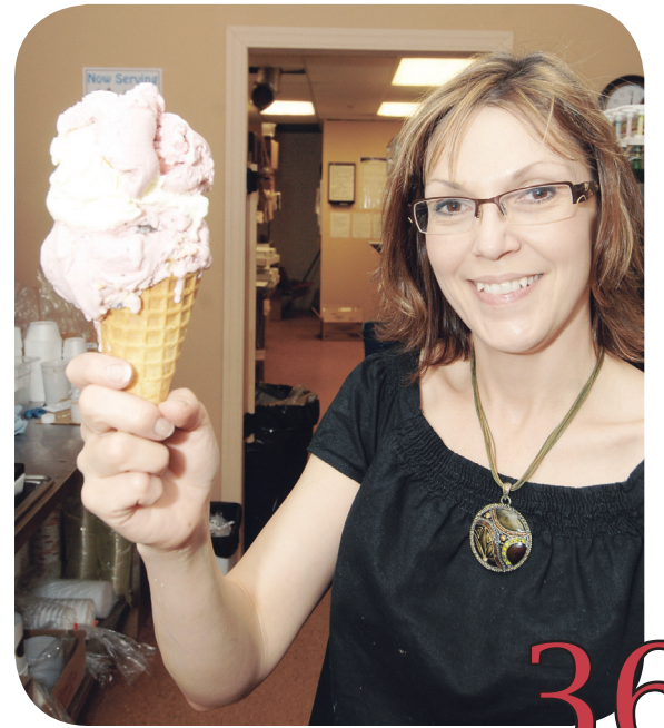
Getting the scoop