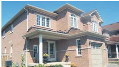
OPEN CONCEPT 4 BEDROOM $389,000