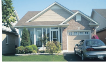
VIRTUAL TOUR @ www.willsell.ca $324,900