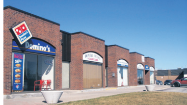
RETAIL SPACE-4 CORNERS OF GEORGETOWN