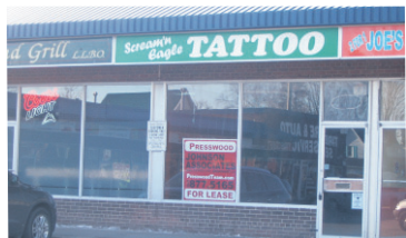
PRIME RETAIL - ON HIGHWAY 7 $15.00/SQ.FT.