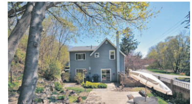
VILLAGE LIVING IN THE GLEN $419,900