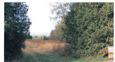
BUILD YOUR DREAM HOME $230,000