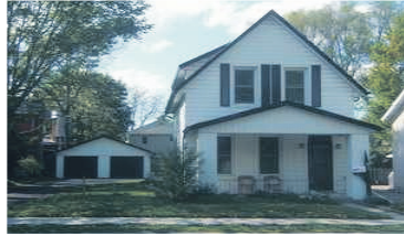
GUELPH - 3 BDRM & DBL CAR GARAGE $299,900

PresswoodTeam.com 09-164-30/10-201-30 W1862054/W1862119