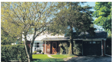
CAREFUL, IT'S LOADED! $329,900