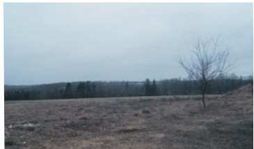
ERIN - 1 ACRE BUILDING LOT $170,000