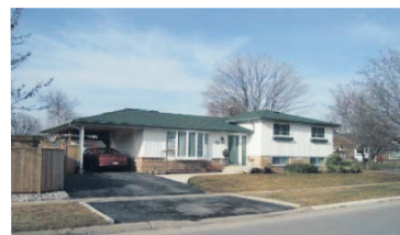
3 BEDROOM, SIDESPLIT $354,900