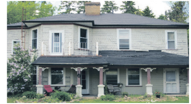
RESTORE ME TO MY GLORY! $309,900