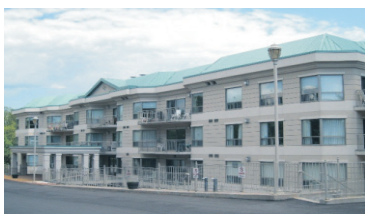
BEAUTIFUL, BRIGHT 2 BEDROOM $299,900

Mary Maan*/Emma Fedor* 10-212-30 W1873572