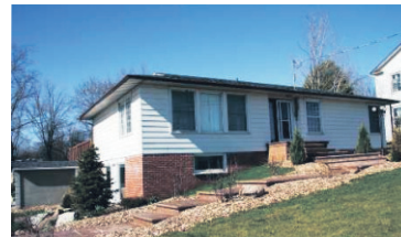
LOVELY UPDATED HOME W/GREAT VIEWS! $424,000