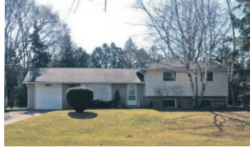
OVER AN ACRE - SHOP! CLOSE TO TOWN! $559,900