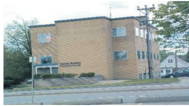
PROFESSIONAL SPACES AVAILABLE

It's easy for you to make good Real Estate decisions backed by your Johnson Associates agent's local knowledge and expertise.