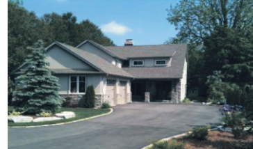
ONE OF A KIND - CUSTOM BUILT! $999,000