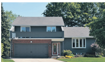
PARK AREA 4+ BDRM-QUIET CUL DE SAC $695,000

Chris* & Lee Gonchar* 10-210-31 W1873483