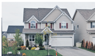
HUGE LANDSCAPED LOT $454,000