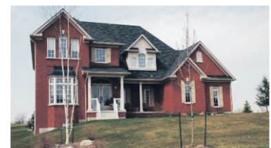
GORGEOUS UPGRADED HOME $679,000