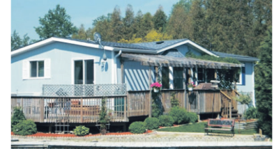
WATERFRONT BUNGALOW $179,900