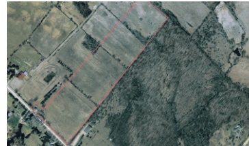
26+ BREATHTAKING ACRES $597,000