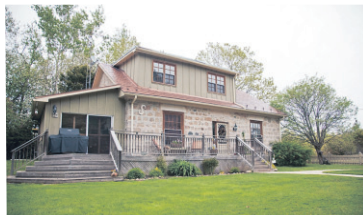
CHARACTER - BEAUTY - CHARM! $435,000