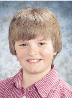
Adam Longwell Park