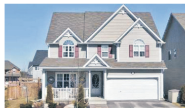
HUGE LANDSCAPED LOT