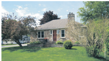
CHARMING STONE HOME