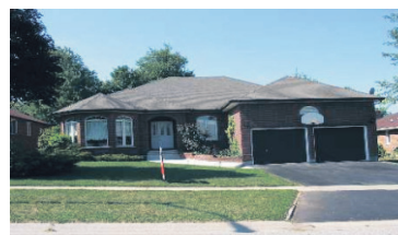
BUNGALOW WITH W/O BASEMENT