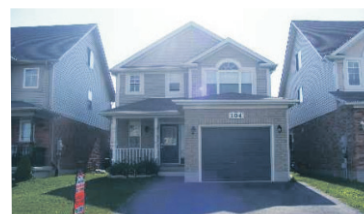
GORGEOUS 3 BEDROOM