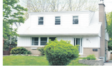
PERFECT FAMILY HOME!