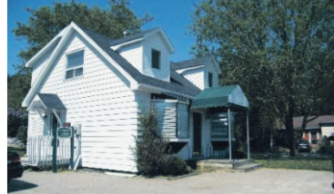
ATTRACTIVE COMMERCIAL PROPERTY-ERIN