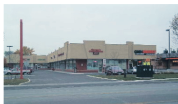
IF LOOKING FOR EXPOSURE, LOOK NO FURTHER