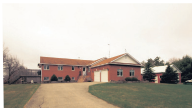
10 ACRES WITH WORKSHOP