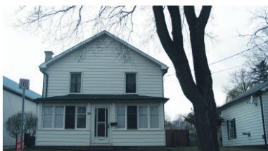
TIME FOR NEXT GENERATION