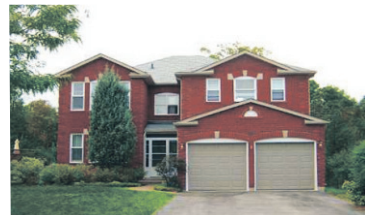
RAVINE ON GOLLOP!