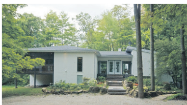
UNIQUE HOME NESTLED WITHIN NATURE