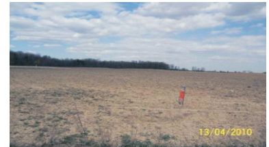
SUPERB LOCATION ON PAVED ROAD