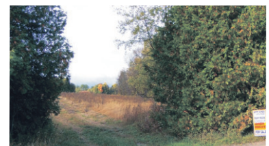
BUILD YOUR DREAM HOME