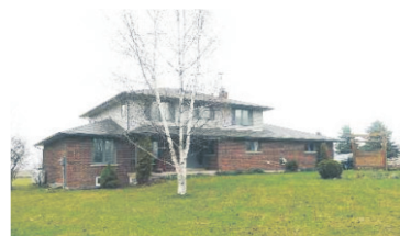
COUNTRY LIVING AT IT'S BEST