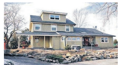
4 BDRM OVERLOOKING POND IN ERIN