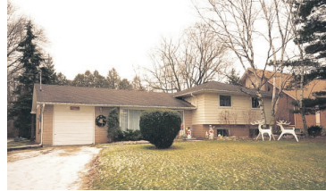
OVER AN ACRE - SHOP! CLOSE TO TOWN!