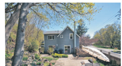
VILLAGE LIVING IN THE GLEN