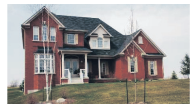
GORGEOUS UPGRADED HOME