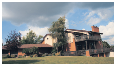
10AC PROP. ON ESCARPMENT-AMAZING VIEWS $1,595,000