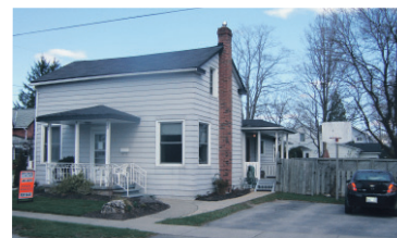
CENTURY HOME - DOWNTOWN ACTON $329,900