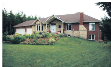
QUALITY WORKMANSHIP ON 1 AC $775,000