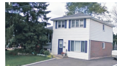
LOVELY 5 BDRM W/SPACIOUS LAYOUT $379,900