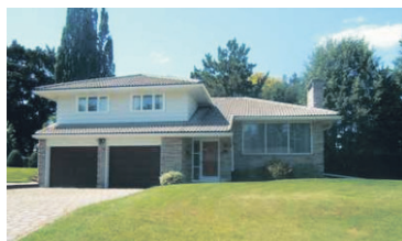
PRIME PARK AREA, CUSTOM HOME $559,000