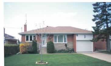
IT'S A PEACH! $455,000