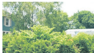
SUPERB BUILDING LOT ON MATURE STREET $104,900