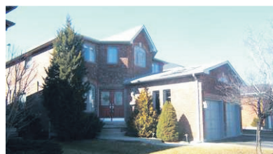
4 BDRM PLUS LOFT ON QUIET CRESCENT $489,000

Listing details available at: www.johnsonassociates.ca