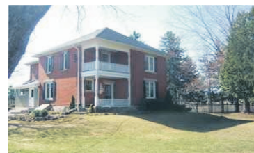
CENTURY CHARM IN THE COUNTRY $619,000