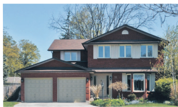
PARK DISTRICT - CUSTOMIZED HOME $599,900