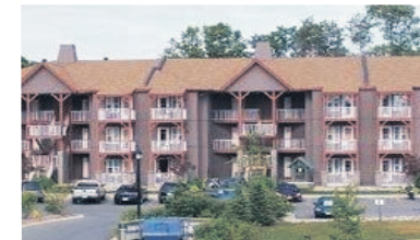
HORSESHOE VALLEY TIMESHARE $9,000