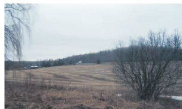
ERIN 98+ ACRE WORKING FARM $800,000