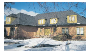
OVER 3700 SQ.FT. OF ELEGANT LIVING $2,990,000