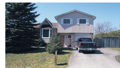
FAMILY FRIENDLY STREET $318,000