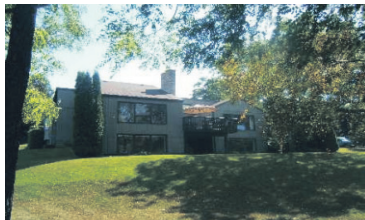
6.5 ROLLING ACRES WITH POND $799,000