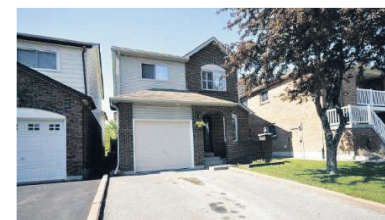
OVER IMPROVED & READY TO MOVE IN $327,500