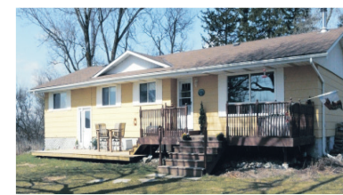
BEAUTIFUL UPDATED HOME ON 5 ACRES $395,000