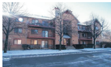
GREAT 3 BDRM CONDO-GREAT LOCATION $234,900