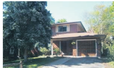
AFFORDABLE IN THE PARK $399,900