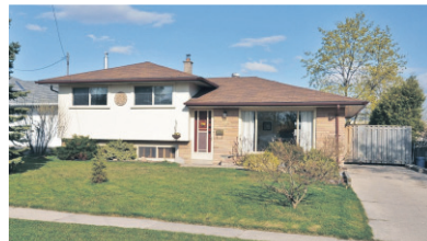
JUST MOVE IN $349,900