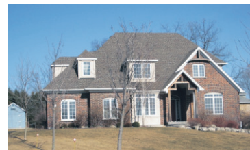
CUSTOM BUILT CHARLESTON IN THE GLEN $1,229,000