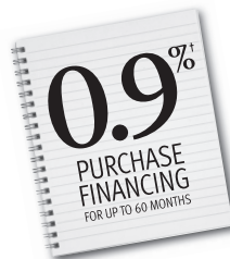
Civic DX Sedan model FA1E2AE