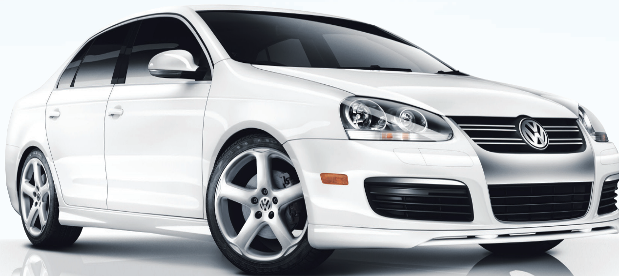
2010 Jetta 2.5 Starting from $23,990 + GST & PST Also available as TDI Clean Diesel