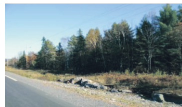
277.79 ACRES OF HARDWOOD & BUSH

$23.00 Sq. Ft. PresswoodTeam.com 09-515-30 W1755619