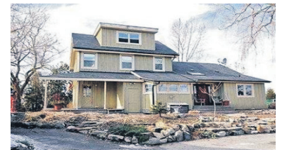
4 BDRM OVERLOOKING POND IN ERIN

$510,900 Monica Keess* 10-101-91 X1814339