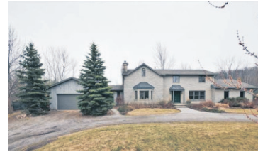
STONEHOUSE; PRIVATE LOCATION

$1,250,000 Jill Johnson* 10-121-31 W1821739