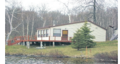
2 BEDROOM COTTAGE ON LAKE

$412,000 Suzanne Lawrence* 10-142-90 W1834687