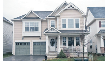
4 BDRM ON FAMILY FRIENDLY CRESCENT

$559,900 Elizabeth Doell* 09-511-30 W1828127