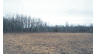
LOVELY 2.1 ACRE LOT

$279,900 Brenda MacDonald* 09-505-91 X1750153