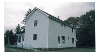
2 STOREY, 3 BEDROOM HOME IN LORING

$549,000 Dianne Penrice**/Julia Stuart* 10-141-91 W1833027