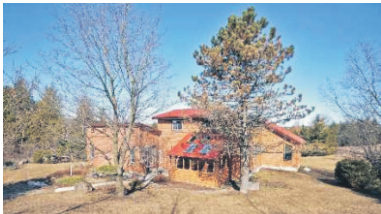
FABULOUS COUNTRY HOME ON 7.23 ACRES

$269,000 Anna Lostritto* 10-072-VL W1791935