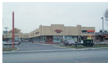
IF LOOKING FOR EXPOSURE, LOOK NO FURTHER

$69,900 Marilyn Kerr* 09-471-VL X1852331