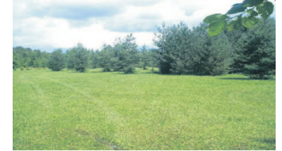
1.73 ACRES JUST WAITING FOR A HOME

$1,250,000 Jill Johnson* 10-121-31 W1821739