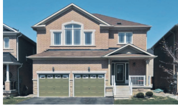
BEAUTIFULLY MAINTAINED 3 + 1 BDRM

$434,900 Derek Dunphy* 10-144-19 W1846486