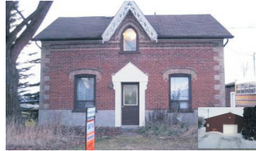
ZONED COMMERCIAL - WORK FROM HOME

$279,900 Brenda MacDonald* 09-505-91 X1750153