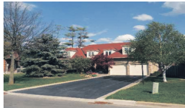
3000 SQUARE FOOT CAPE COD

$634,900 PresswoodTeam.com 10-193-19 W1856316