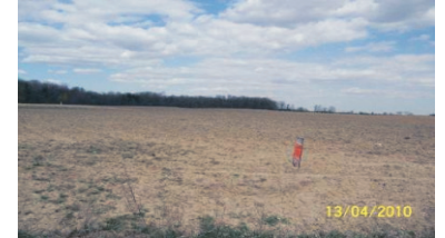
SUPERB LOCATION ON PAVED ROAD

$439,000 Kathy Ellis* 10-147-30 W1837292