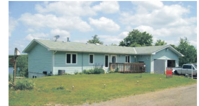
4 BEDROOM ON JACK'S LAKE

$647,000 Kathy Ellis* 10-019-60 W1787864