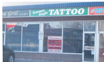
PRIME RETAIL - ON HIGHWAY 7

$659,900 Sandra Brianceau* 09-377-99 W1807712