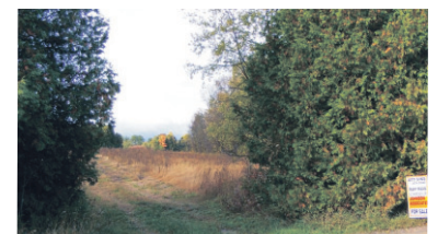
BUILD YOUR DREAM HOME