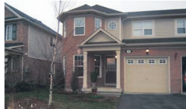
A CREAM PUFF - INSIDE & OUT