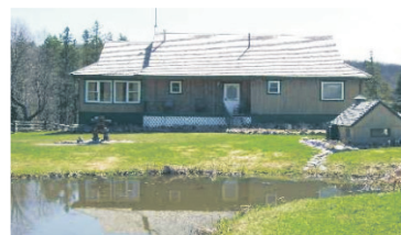
2 + 2 BEDROOM WITH WORKSHOP