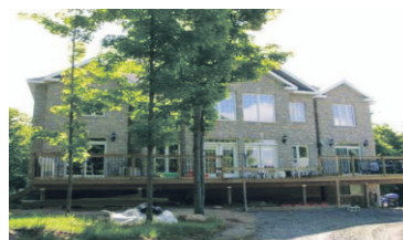
BEAUTIFUL OPEN CONCEPT ON APPRX 10 AC $399,000