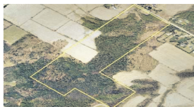
94 ACRES OF PRIME LAND $499,000