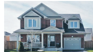
BEAUTIFUL 4 BDRM-LRG PIE SHAPED LOT $372,900