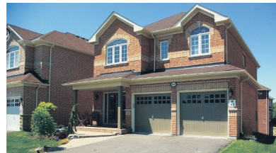
4 BDRM WITH WALKOUT BASEMENT! $550,000