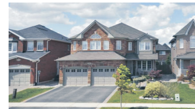
4 BDRM W/UPGRADES ON DESIRABLE ST! $519,900