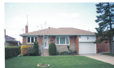
IT'S A PEACH! $499,900