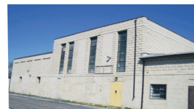
INDUSTRIAL UNIT IN HEART OF GEORGETOWN