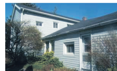
GLEN WILLIAMS - HUGE LOT $319,000