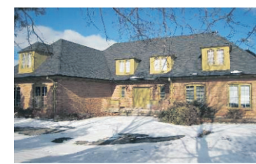
OVER 3700 SQ.FT. OF ELEGANT LIVING $2,990,000