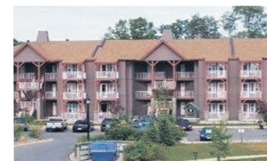
HORSESHOE VALLEY TIMESHARE $9,000