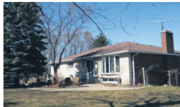
CUSTOM BUILT BUNGALOW ON 1.37 AC $599,000