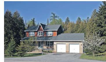
OPEN CONCEPT W/WALK OUT BSMT! $469,900