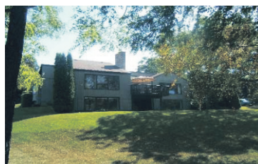
6.5 ROLLING ACRES WITH POND $799,000