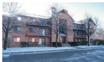
GREAT 3 BDRM CONDO-GREAT LOCATION $234,900