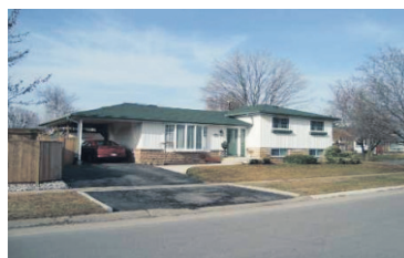
PRIDE OF OWNERSHIP-WELL MAINTAINED $359,900