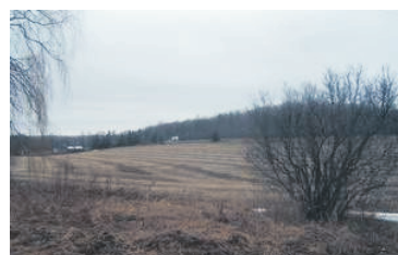
ERIN 98+ ACRE WORKING FARM $800,000