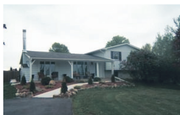
STUNNING HOME, POND, 2+ACRES $508,900