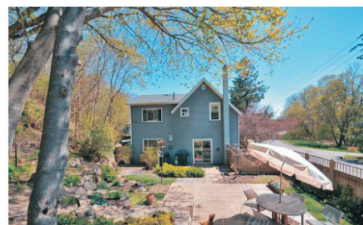
573 Main Street, Glen Williams Sunday, May 16, 2:00-4:00 $424,900