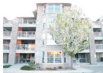
BEAUTIFUL STARTER $184,900