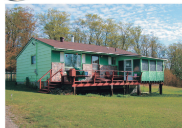
CUSTOM BUNGALOW ON 2.85 ACRES $124,900