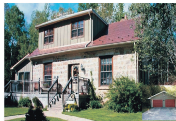
CHARACTER BEAUTY - CHARM! $435,000