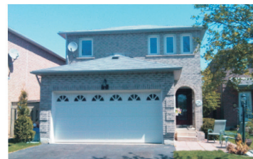
40 McKinnon Avenue, Georgetown Sat May 15 & Sun May 16, 2:00-4:00 $399,900