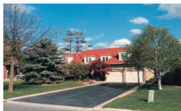
28 Oakridge Court, Brampton Sat May 15 & Sun May 16 2:00-4:00 $634,900