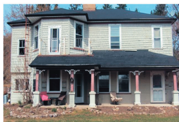
RESTORE ME TO MY FORMER GLORY! $309,900