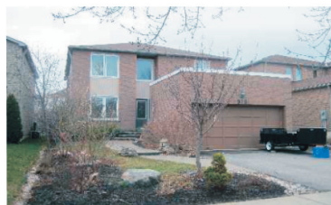
318 Barber Drive, Georgetown Sunday, May 16, 2:00-4:00 $459,000