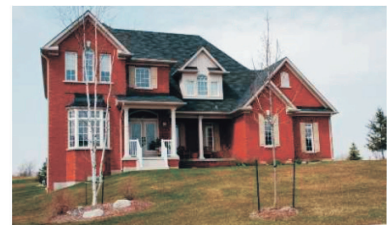
54 Upper Canada Dr., Hillsburgh Sunday, May 16, 2:00-4:00 $679,000