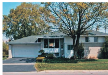
FANTASTIC BUNGALOW $379,900