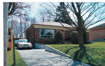
30 Hewson Crescent, Georgetown Saturday, May 15, 2:00-4:00 $348,600