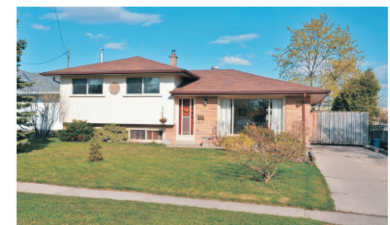
6 Moultrie Crescent, Georgetown Sat May 15 & Sun May 16, 2:00-4:00 $349,900