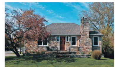
34 Confederation Street, Glen Williams Sat May 15 & Sun May 16, 2:00-4:00 $349,900