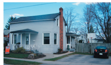
19 Frederick Street, Acton Saturday, May 15, 2:00-4:00 $329,900

Johnson Associates Open House Tour Plan your weekend – when and where to attend the most desireable open houses: www.johnsonassociates.ca