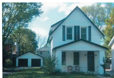
GUELPH 3 BDRM + DBL CAR GAR $299,900