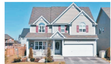
109 Hampson Crescent, Rockwood Sunday, May 16, 2:00-4:00 $454,000