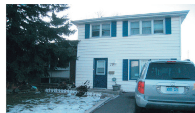
79 Moore Park Cres., Georgetown Sunday, May 16, 2:00-4:00 $379,900