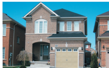
121 Ballintine Drive, Georgetown Sunday, May 16, 2:00-4:00 $429,900