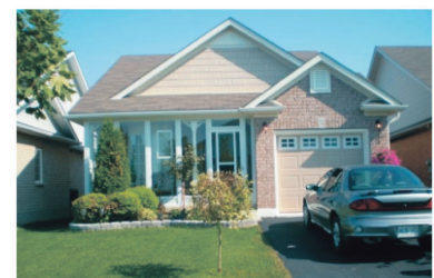
VIRTUAL TOUR @ WWW.WILLSSELL.CA $334,900