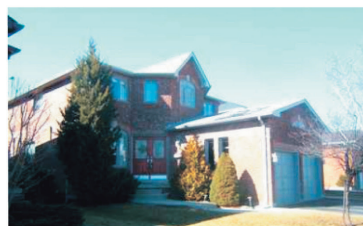
9 Roane Avenue, Georgetown Sunday, May 16, 2:00-4:00 $489,000