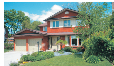
22 Gardiner Drive, Georgetown Sat May 15 & Sun May 16, 2:00-4:00 $599,900