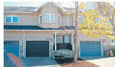
53 Harding Street, Georgetown Sunday, May 16, 2:00-4:00 $315,000

Full listing details available at: www.johnsonassociates.ca