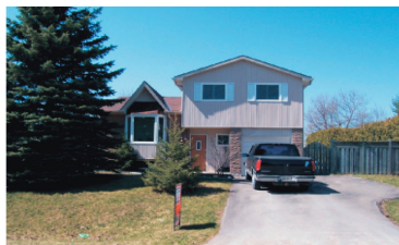
8 Douglas Crescent, Hillsburgh Sunday, May 16, 2:00-4:00 $324,800