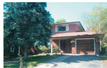
77 Charles Street, Georgetown Sat May 15 & Sun May 16 2:00-4:00 $399,900