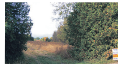
BUILD YOUR DREAM HOME