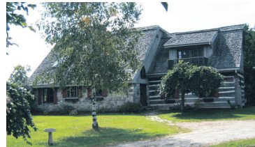
FABULOUS COUNTRY RETREAT-18 AC W/POND

Jill Johnson* $799,900 09-422-91 X1707715