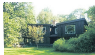
LIMEHOUSE, 24.99 ACRES, SHOP

David Burland* $454,000 10-113-91 X1817585