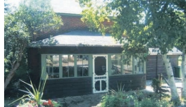
RARE FIND - RIVER BEHIND