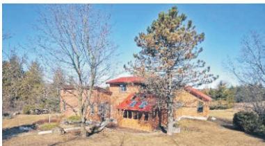
FABULOUS COUNTRY HOME ON 7.23 ACRES

Anna Lostritto* $269,000 10-072-VL W1791935