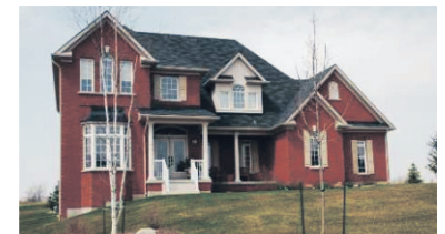
GORGEOUS UPGRADED HOME