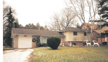
OVER AN ACRE - SHOP! CLOSE TO TOWN!

Elizabeth Doell* $559,900 09-511-30 W1828127