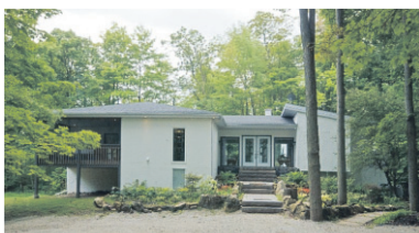
UNIQUE HOME NESTLED WITHIN NATURE

Kathy Ellis* $679,000 10-157-91 X1841976