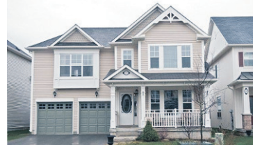
4 BDRM ON FAMILY FRIENDLY CRESCENT

Elizabeth Doell* $559,900 09-511-30 W1828127