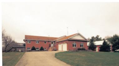
10 ACRES WITH WORKSHOP

Sandra Brianceau* $585,000 10-143-91 X1834611