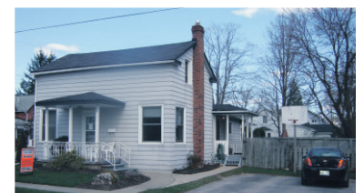
CENTURY HOME - DOWNTOWN ACTON

Dianne Penrice**/Julia Stuart* $549,000 10-141-91 W1833027