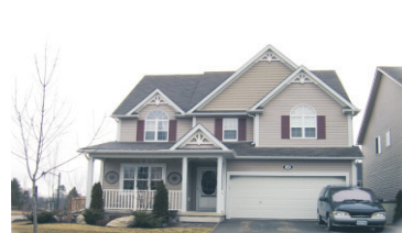
HUGE LANDSCAPED LOT

PresswoodTeam.com $23.00 Sq. Ft. 09-515-30 W1755619