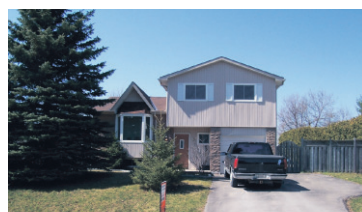
FAMILY FRIENDLY STREET

PresswoodTeam.com $299,900 10-087-30 W1796999