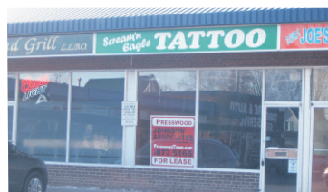
PRIME RETAIL - ON HIGHWAY 7

Sandra Brianceau* $659,900 09-377-99 W1807712