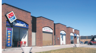
RETAIL SPACE-4 CORNERS OF GEORGETOWN

Sandra Brianceau* $139,000 10-044-VL X1784307