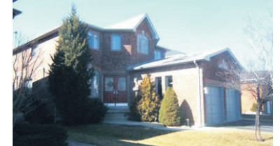
4 BDRM PLUS LOFT ON QUIET CRESCENT

Suzanne Lawrence* $412,000 10-142-90 W1834687