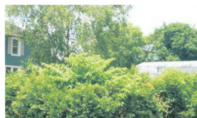
SUPERB BUILDING LOT ON MATURE STREET $104,900 Elizabeth Doell* 10-093-VL W1803960