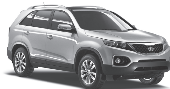
Sorento EX-V6 Luxury shown

Introducing the all-new 2011 Kia Sorento crossover SUV. With available 7-passenger seating, all-wheel drive, panoramic sunroof and standard Bluetooth® hands-free cell phone capability, the Sorento truly provides A NEW WAY TO SEE THE WORLD.