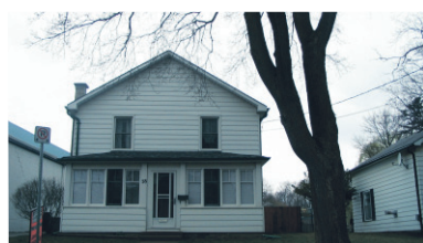
TIME FOR NEXT GENERATION $299,900 PresswoodTeam.com* 10-089-30 W1799699