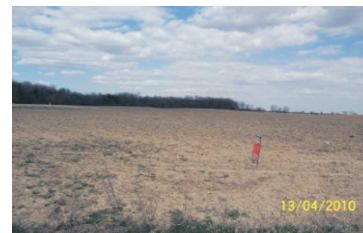
SUPERB LOCATION - CLOSE TO TOWN! $274,000 Anna Lostritto* 10-004-VL W1765092