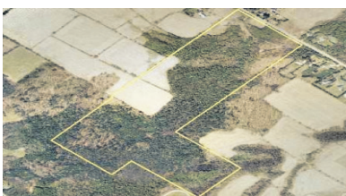
94 ACRES OF PRIME LAND $499,000 David Burland* 07-636-VL W1749927