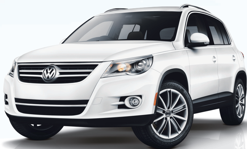
2010 Tiguan Starting from $29,830 +GST&PST