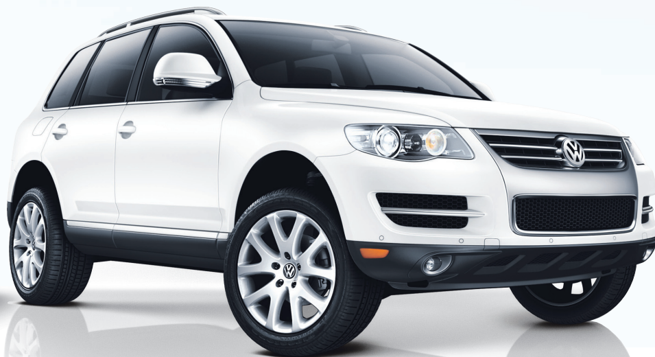
2010 Touareg Starting from $47,255 +GST&PST Also available as TDI Clean Diesel