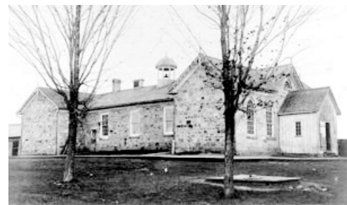
The original stone school house, 1859.