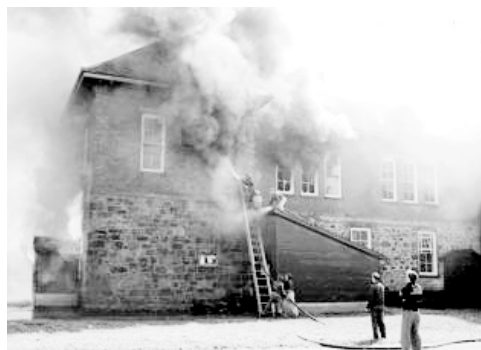
Firefighters battle the 1957 blaze.

During the day, hayrides will bring people from the park to the school. A bouncy castle will be available for children, a number of choirs, including the Robert Little Public School Choir will perform and Maple Leaf Farms will be on site providing food for visitors.