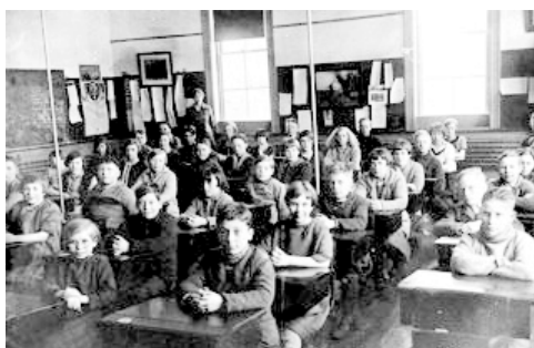
Robert Little School has had many children pass through its doors in the last 150 years. Here is a classroom photo, circa 1940s.