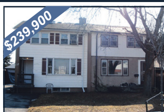
$239,900 SEMI'S IN MATURE MILTON 128 & 132 Heslop Road – Perfect for investors, handymen, great lots in old Milton, call today for your personal viewing!