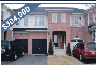
$304,900 TOWNHOME IN GREAT LOCATION 1055 Kennedy Circle – Walking distance from plaza & close to schools, eat-in kitchen, main floor laundry, master w/w/i closet & ensuite.