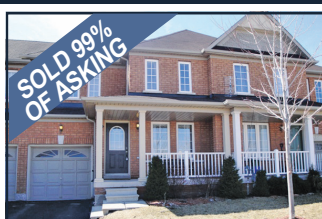
SOLD 99% OF ASKING TOWNHOME IN GREAT LOCATION 2480 Postmaster Dr. – Backing onto park, steps to school, main floor gleams w/hdwd fir T/O, kitchen offers upgraded cabinets & pantry, professionally finished basement, 2nd floor laundry.