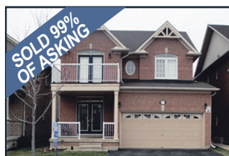
SOLD 99% OF ASKING SPACIOUS & ELEGANT 1075 Costigan Road – Sep dining room, living room w/vaulted ceilings, prof finished basement, just move in & enjoy.