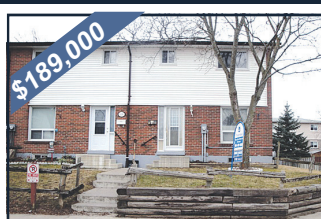
$189,000 END UNIT CONDO TOWNHOME 116 Kingham Road – Eat-in Kitchen O/L living, dining room combination, cozy rec room w/w/o to fully fenced yard, master w/ensuite.