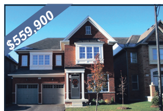
$559,900 VIEW OF ESCARPMENT 368 Holmes Cres – Premium lot, over 40k in upgrades, granite & marble in lg eat-in kitchen, 4 bedrooms, 3.5 baths.