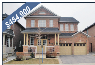
$454,900 ABSOLUTELY STUNNING 279 Fleming Dr. – Detached, 3 Bedrooms, Separate dining room, large eat-in kitchen w/granite counter & backsplash, oversized master w/4pc ensuite, landscaped backyard w/cabana & hot tub.