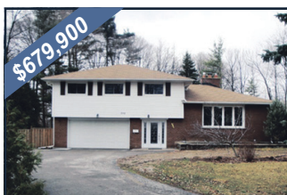
$679,900 LARGE 3 LEVEL SIDESPLIT 350 Ontario Street – Huge lot, hdwd floor T/O, finished lower level, mature lot & trees for privacy, 2 tier deck.