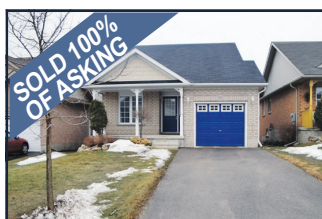
SOLD 100% OF ASKING GORGEOUS BUNGALOW 82 Doctor Moore – Open concept, living room w/vaulted ceiling to 3rd bedroom loft w/3pc ensuite, bright kitchen, quiet family court.