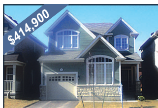
$414,900 MATTAMY PINEHURST MODEL 898 Scott – Main floor w/9ft ceilings, family room, sep dining room, kitchen w/breakfast bar island & w/o to yard.