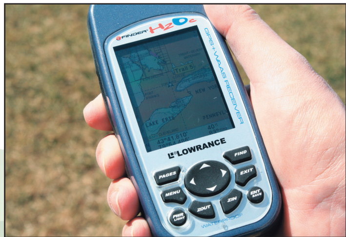
Handheld Global Positioning System (GPS) Device

Geocaching is a world wide phenomenon and is happening right here in Halton Hills too.