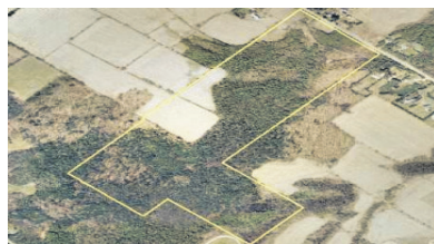
94 ACRES OF PRIME LAND $499,000 David Burland* 07-636-VL W1749927