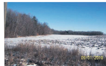
SUPERB LOCATION - CLOSE TO TOWN! $274,000 Anna Lostritto* 10-004-VL W1765092