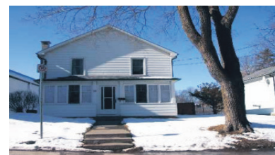
TIME FOR NEXT GENERATION $299,900 PresswoodTeam.com* 10-087-30 W1799699