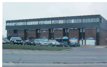
OFFICE SPACE FOR LEASE-GREAT LOCATION! $1,000/Month PresswoodTeam.com 09-118-30 W1704475