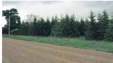
BUILD YOUR DREAM HOME-BEAUTIFUL 1.4 AC $185,000 Suzanne Lawrence* 08-398-VL X1753604