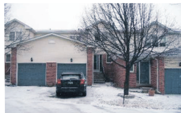
PERFECT HOME FOR FIRST TIME BUYERS $239,900 PresswoodTeam.com* 10-077-30 W1793880