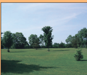
PARK-LIKE 2.74 ACRES $699,900!!

Stunning, all brick, custom home featuring a modern open concept design & a unique blend of elegance and country charm. Beautifully decorated & recently improved with richly stained walnut floors, ceramics & lovely new trim & baseboards. Impressive great room with floor-to-cathedral ceiling brick fireplace. Full 1 bdrm inlaw suite beautifully done with games room, living room with stone fireplace and lots of pot lights. Detached dbl car garage plus a fantastic workshop (30'x55') with heat, hydro, water, 14' ceiling, 2 truck doors & mezzanine. Great location - just 20 min. to Georgetown GO. Call for full details.