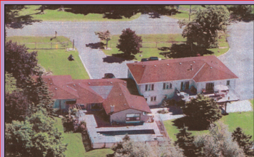
MULTI FAMILY HOME... UNIQUE DESIGN ON 1 ACRE PROPERTY $745,000

JUST SOLD WAY OVER ASKING Get the Most Experience Working For You.