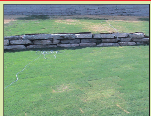
MOVE A LITTLE WEST AND LOOK WHAT YOU CAN GET!!! $369,900!!

Loaded!!!!!! All brick, 2400 sq ft of exceptional quality including ceramics and exotic hardwood on entire main floor... also featuring a maple kitchen to die for including granite countertops, extended height maple cabinets, breakfast bar, mouldings top and bottom, pot lights, additional pantry space, chef's desk, garden doors, the list goes on and on. A master bedroom and ensuite that you have to see to believe... huge room, huge walk-in closet, huge 5 pc ensuite with huge shower with 2 rain showerheads... come see us on the weekend to check out this home. A pocket of 50 homes in growing area right off the 401 (2 mins). Designer colours... never lived in.