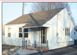
240 MCDONALD BLVD. $209,900

Big bang for your buck here. Set on approx. 1 acre of beauty that's 5 minutes to Brampton and 5 minutes to Georgetown, a dream location! This 6 bedroom monster is like no other you've ever seen. It features all the fixins including 3 separate entrances, 4 oversized garages with huge doors, circular driveway & inground tiled pool with concrete patio, Much more.