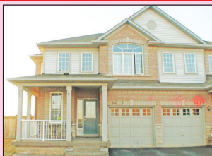
5417 SUNDIAL $344,900

Custom Built Craftsman home has been completely renovated and lovingly decorated to suit the most impeccable of tastes! Hand-built mouldings and wainscoting at every turn, stunning new maple kitchen with huge island & granite countertops, dark/rich & warm/inviting hardwood flooring throughout including solid wood staircase, marble flooring in foyer/kitchen/laundry & an original wood burning fireplace as the focal on the main floor to only name a few of the amazing details you'll find in this showhome. Master bedroom sanctuary comes complete w soaring cathedral ceilings, stunning decor including dramatic hardwood flooring, walk-in/His and Her closets, 5Pc ensuite featuring amazing glass shower for two plus Jacuzzi tub, travertine marble vanity tops with gorgeous cabinetry work, polished chrome taps... all straight out of House and Home magazine! Too much to mention... visit 4Edith.SoldonHrkac for full details and photos. This home will make you feel like a king and queen and leave your family and friends speechless. Call for your private viewing!!