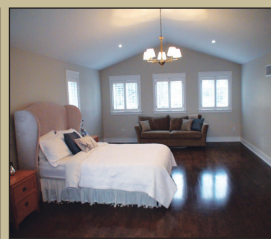
ONE-OF-A-KIND PARK DISTRICT MASTERPIECE GUARANTEED TO PLEASE $819,900

Custom Built Craftsman home has been completely renovated and lovingly decorated to suit the most impeccable of tastes! Hand-built mouldings and wainscoting at every turn, stunning new maple kitchen with huge island & granite countertops, dark/rich & warm/inviting hardwood flooring throughout including solid wood staircase, marble flooring in foyer/kitchen/laundry & an original wood burning fireplace as the focal on the main floor to only name a few of the amazing details you'll find in this showhome. Master bedroom sanctuary comes complete w soaring cathedral ceilings, stunning decor including dramatic hardwood flooring, walk-in/His and Her closets, 5Pc ensuite featuring amazing glass shower for two plus Jacuzzi tub, travertine marble vanity tops with gorgeous cabinetry work, polished chrome taps... all straight out of House and Home magazine! Too much to mention... visit 4Edith.SoldonHrkac for full details and photos. This home will make you feel like a king and queen and leave your family and friends speechless. Call for your private viewing!!