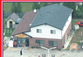
WORK AND LIVE FOR ONE LOW PRICE $399,900

SOLD Get the Most Experience Working For You.