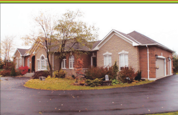
2 ACRES IN ESTATE SUBDIVISION - BACKS ONTO TREES AND GREENLAND $839,900

Prime Location just 5 minutes to 401. Custom built residence with triple car garage & pattern concrete front walkway. Features massive principal rooms just perfect for entertaining family or huge gatherings. Spacious kitchen has lots of cabinets & built-in appliances. Main floor laundry is conveniently close. Main floor office plus a family room with fireplace & garden doors lead to deck. Separate living dining room. Circular oak staircases leads to large bedrooms & 3 full baths. Master suite features his 'n hers closets, whirlpool & garden door to front balcony. Neutral décor & parquet leads through house. Unspoiled basement just waiting for your decorating ideas. Call for full details.