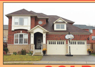
38 APPLE BLOSSOM $539,900

Loaded!!!!!! All brick, 2400 sq ft of exceptional quality including ceramics and exotic hardwood on entire main floor... also featuring a maple kitchen to die for including granite countertops, extended height maple cabinets, breakfast bar, mouldings top and bottom, pot lights, additional pantry space, chef's desk, garden doors, the list goes on and on. A master bedroom and ensuite that you have to see to believe... huge room, huge walk-in closet, huge 5 pc ensuite with huge shower with 2 rain showerheads... come see us on the weekend to check out this home. A pocket of 50 homes in growing area right off the 401 (2 mins). Designer colours... never lived in.