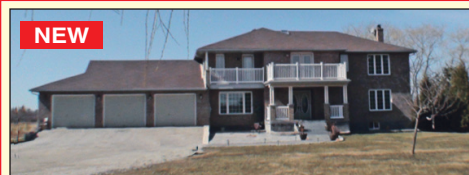
NEW 3 ACRES SOUTH OF GEORGETOWN $925,000!!

JUST SOLD OVER ASKING Get the Most Experience Working For You.