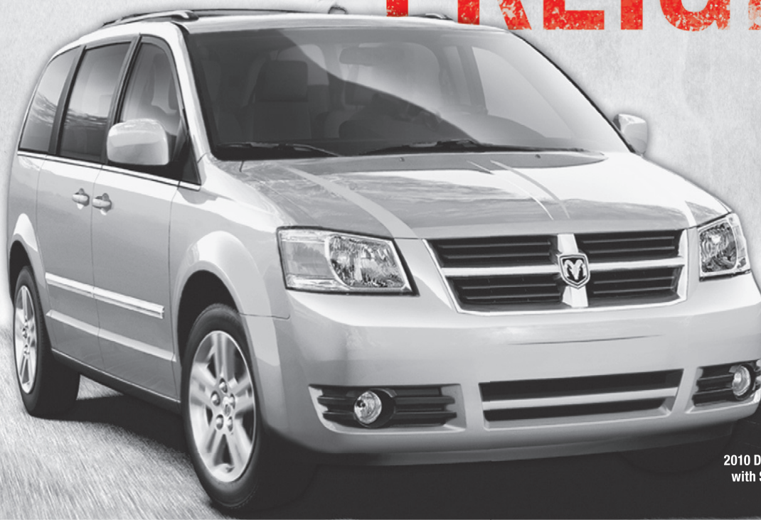
2010 Dodge Grand Caravan SXT with SXT Plus Group shown.**

WHEN YOU PICK UP YOUR NEW ELIGIBLE DODGE GRAND CARAVAN, YOU PICK UP AN EXTRA $1,400.†