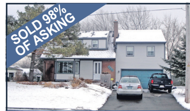
SOLD 98% OF ASKING GREAT LOT 206 Bell Street - Addition w/double garage, mature neighbourhood, close to downtown, lots of parking.