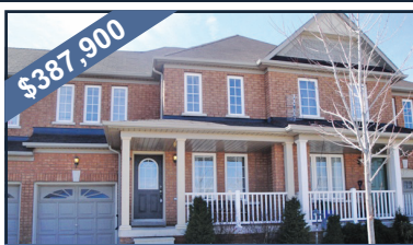
$387,900 TOWNHOME IN GREAT LOCATION 2480 Postmaster Dr. - Backing onto park, steps to school, main floor gleams w/hwdwd fir T/O, kitchen offers upgraded cabinets & pantry, professionally finished basement, 2nd floor laundry.