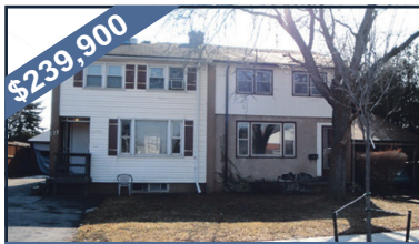
$239,900 SEMI'S IN MATURE MILTON 128 & 132 Heslop Road - Perfect for investors, handymen, great lots in old Milton, call today for your personal viewing!