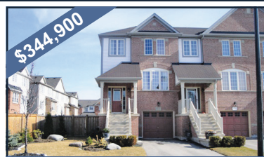
$344,900 LOVELY END UNIT TOWNHOME 1210 Lamont Cres. - Large lot beautifully landscaped, eat-in kitchen w/ceramic floor, master offers a w/i closet & 4pc ensuite, lower level family room w/w/o to custom lighted deck.