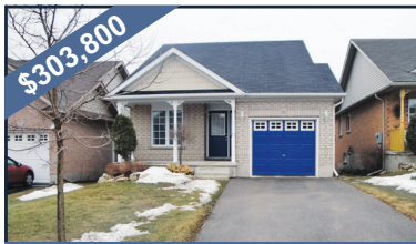
$303,800 GORGEOUS BUNGALOW 82 Doctor Moore - Open concept, living room w/vaulted ceiling to 3rd bedroom loft w/3pc ensuite, bright kitchen, quiet family court.