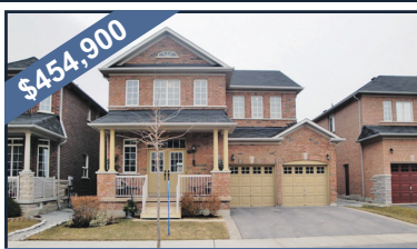
$454,900 ABSOLUTELY STUNNING 279 Fleming Dr. - Detached, 3 Bedrooms, Separate dining room, large eat-in kitchen w/granite counter & backsplash, oversized master w/4pc ensuite, landscaped backyard w/cabana & hot tub.