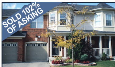
SOLD 102% OF ASKING LOOK NO FURTHER 1228 Mcdowell Cres - Freehold Townhome Shows 10+, Backing Onto Park, Kitchen W/Slate Fir & Backsplash, Maple Cabinets, Finished Lower Level.