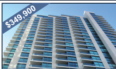
$349,900 FANTASTIC VIEW 235 Sherway Gardens Rd #2303 - View Of Skyline & Lake Ontario, 2 Bedroom Condo, 9ft Ceilings, Hardwood Floors. Or Lease for $1,700/mth