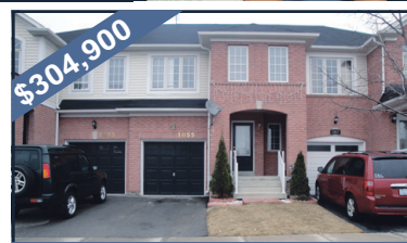
$304,900 TOWNHOME IN GREAT LOCATION 1055 Kennedy Circle - Walking distance from plaza & close to schools, eat-in kitchen, main floor laundry, master w/w/i closet & ensuite.