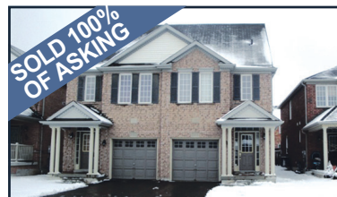
SOLD 100% OF ASKING SPECTACULAR SEMI 1185 Houston Drive - Shows 10+ Won't Last Long, Separate Dining Room, Large Eat-In Kitchen, 2nd Level Sitting Area.