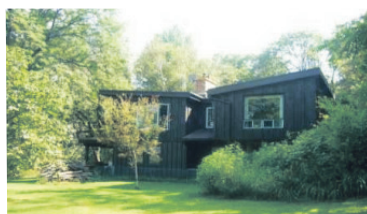
LIMEHOUSE, 24.99 ACRES, SHOP