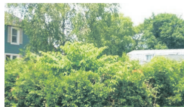
SUPERB BUILDING LOT ON MATURE STREET!