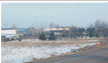
LOVELY 2.1 ACRE LOT

Brenda MacDonald* $279,900 09-505-91 X1750153