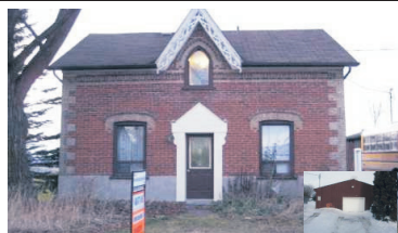
ZONED COMMERCIAL - WORK FROM HOME

Brenda MacDonald* $279,900 09-505-91 X1750153