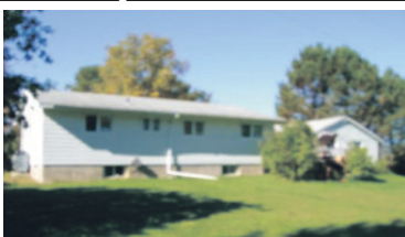
3 + 1 BEDROOM - FULL BASEMENT