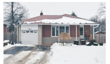
GENEROUS LOT - SALT WATER POOL!