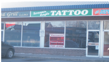
PRIME RETAIL - BUSY PLAZA