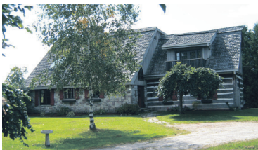
FABULOUS COUNTRY RETREAT-18 AC W/POND