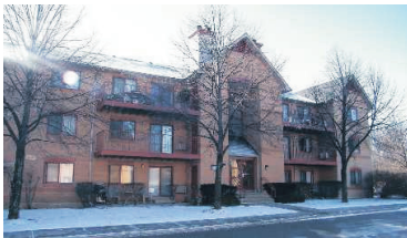
GREAT 3 BDRM CONDO IN OAKVILLE