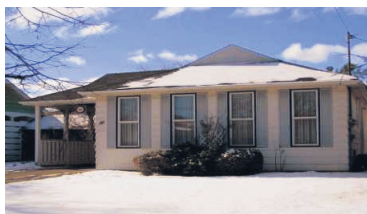
UPDATED BUNGALOW W/GOURMET KIT