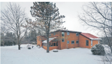
FABULOUS COUNTRY HOME ON 7.23 ACRES