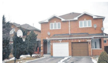
3 BEDROOM SEMI IN GREAT LOCATION!