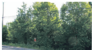
1/2 ACRE LOT IN PORT LORING