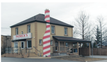
LOCATION, LOCATION, LOCATION