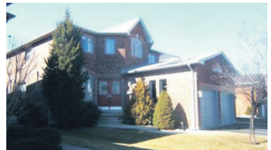
4 BDRM PLUS LOFT ON QUIET CRESCENT