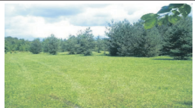
CALL THE ARCHITECT & THE BUILDER NOW!