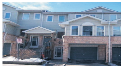
FABULOUS STARTER HOME!