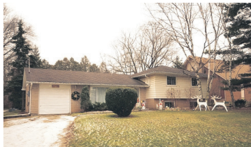
OVER AN ACRE - SHOP! CLOSE TO TOWN!