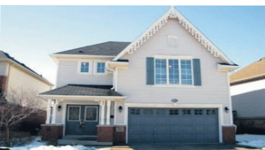
QUIET FAMILY FRIENDLY CRESCENT