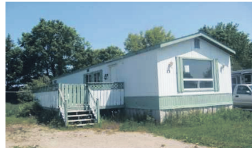
ATTENTION FIRST TIME BUYERS!