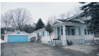
COZY BUNGALOW IN GLEN WILLIAMS