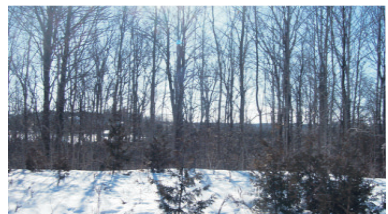
21 ACRES - HOBBY FARM POTENTIAL