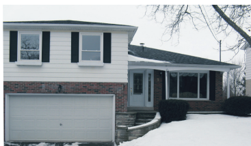
RAVINE LOT, QUIET COURT, INGROUND POOL!