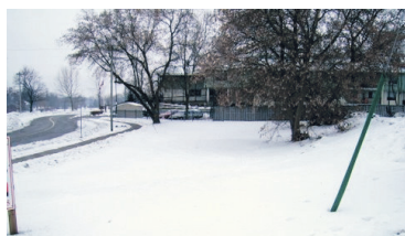
COMMERCIAL LAND ON HIGHWAY #7 & #25