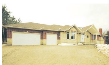
2 YR NEW CUSTOM BUNGALOW ON 1 AC $775,000