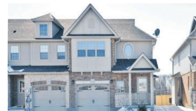
VIRTUAL TOUR @ www.willsell.ca $279,900