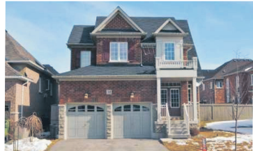
BRIGHT OPEN CONCEPT HOME $539,900