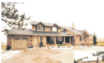
SIMPLY GORGEOUS;RENO'D TOP TO BOTTOM $875,000