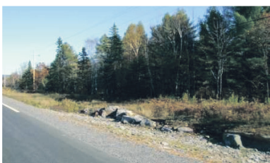
.71 ACRE LOT ON PAVED ROAD $69,900