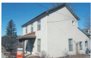
NEW LOW PRICE! $229,000

Jill Johnson* 10-059-30 EXCLUSIVE W1778994