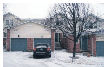
PERFECT HOME FOR FIRST TIME BUYERS $239,900