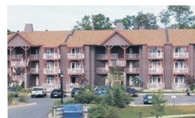
HORSESHOE VALLEY TIMESHARE $9,000