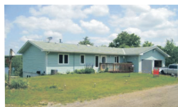
4 BEDROOM HOME ON JACKS LAKE $439,000