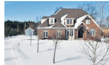
CUSTOM BUILT CHARLESON IN THE GLEN $1,325,000