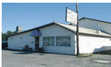
MODERN WELL-ESTABLISHED RESTAURANT $499,900