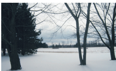
POTENTIAL - DEVELOPMENT FARM $1,500,000

Jill Johnson* 10-059-30 EXCLUSIVE W1778994