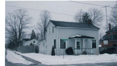
CENTURY HOME - DOWNTOWN ACTON $339,900