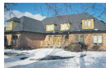
OVER 3700 SQ.FT. OF ELEGANT LIVING $2,990,000