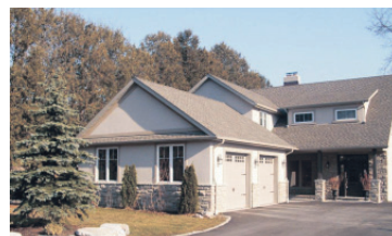
GORGEOUS 3600 SQ FT ON GOLF COURSE $995,000