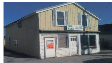
COMMERCIAL BUILDING - C1 ZONING $150,000