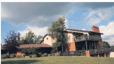
10AC PROP. ON ESCARPMENT-AMAZING VIEWS $1,595,000