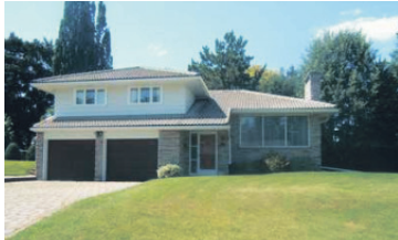
PRIME PARK AREA, CUSTOM HOME $559,000