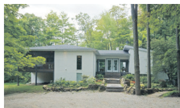
UNIQUE HOME NESTLED WITHIN NATURE $659,900