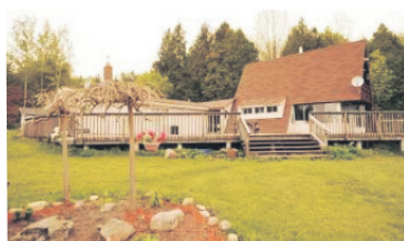
HILLSBURGH SPRING TROUT FARM $756,550