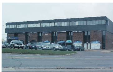
OFFICE SPACE FOR LEASE-GREAT LOCATION! $1,000/Month