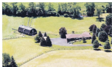
EQUESTRIAN'S DELIGHT $1,575,000