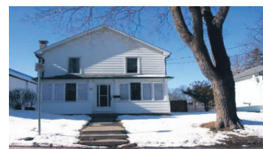
TIME FOR NEXT GENERATION $299,900