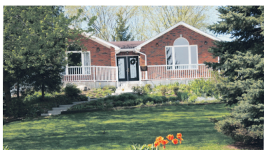
FABULOUS FARM WITH 150K INCOME $1,199,000

Listing details available at: www.johnsonassociates.ca