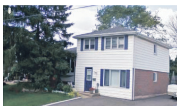
LOVELY 5 BDRM W/SPACIOUS LAYOUT $414,000