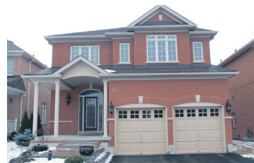
CONTINUOUSLY UPGRADED SINCE NEW! $589,000