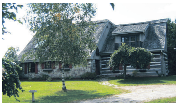
FABULOUS COUNTRY RETREAT-18 AC W/POND $799,900