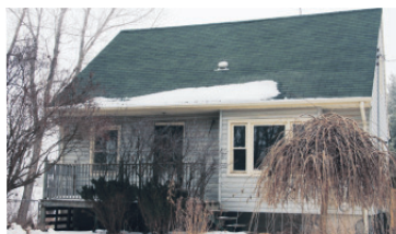
UNIQUE OPPORTUNITY $647,000