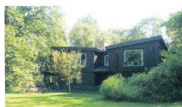
LIMEHOUSE, 24.99 ACRES, SHOP $879,000