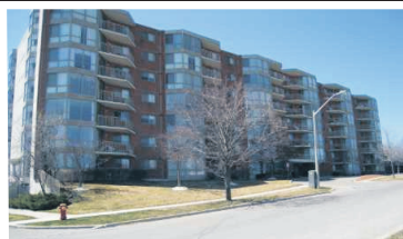
CHARMING, BRIGHT CONDO $219,900