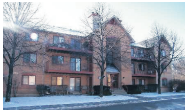
GREAT 3 BDRM CONDO IN OAKVILLE $238,000