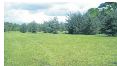
CALL THE ARCHITECT & THE BUILDER NOW! $139,000