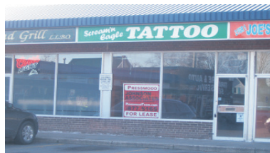
PRIME RETAIL - BUSY PLAZA $15.00/Sq. Ft.