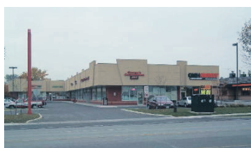
IF LOOKING FOR EXPOSURE, LOOK NO FURTHER $23.00 Sq. Ft.