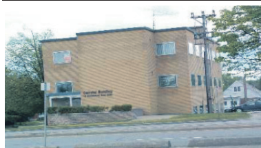
PROFESSIONAL SPACES AVAILABLE

It's easy for you to make good Real Estate decisions backed by your Johnson Associates agent's local knowledge and expertise.