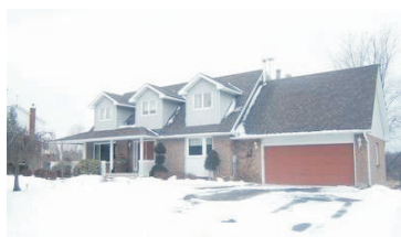
CAPE COD IN THE COUNTRY $599,000