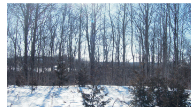
21 ACRES - HOBBY FARM POTENTIAL $219,000