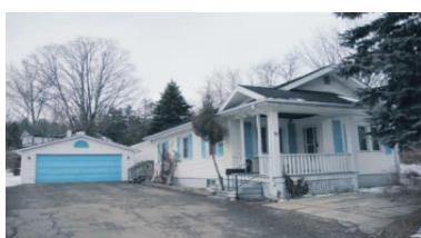
COZY BUNGALOW IN GLEN WILLIAMS $379,900