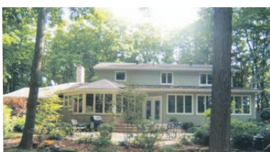
SUPERB ON SOUGHT AFTER 6TH LINE $939,000