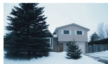
WHEN FORMAL MEETS OPEN CONCEPT $324,800