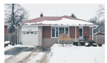
GENEROUS LOT - SALT WATER POOL! $364,900