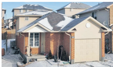
SEE PICS @ www.WILLSSELL.ca $289,900