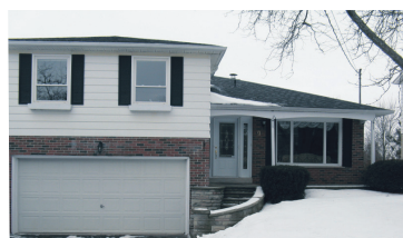
RAVINE LOT, QUIET COURT, INGROUND POOL! $519,900