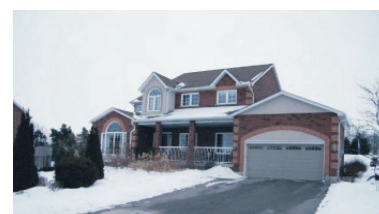
IT WAS WORTH THE WAIT $580,000