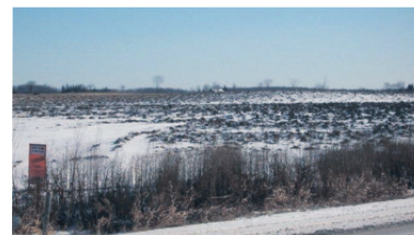
SUPERB LOCATION ON PAVED ROAD $269,000