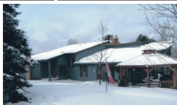
TRULY SPECTACULAR 12 ACRE PROPERTY $949,000