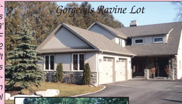
Gorgeous Ravine Lot

THIS could be YOUR backyard and kitchen this SUMMER! DREAM 68' x 473' lot backs onto RAVINE/GOLF COURSE. 3600 SQ. FT. - 2 yrs NEW CUSTOM built LUXURY. 4 bdrms, gorgeous finishes throughout, fireplaces, stunning, gourmet eat-in entertainers kitchen, beautiful finished basement. Marble, onyx, granite. The list goes on.