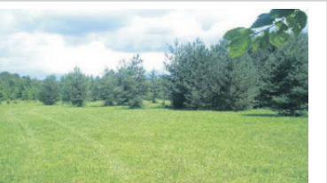
CALL THE ARCHITECT & THE BUILDER NOW! $139,000 Sandra Brianceau* 10-044-VL X1784307