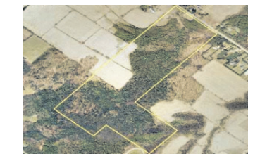
94 ACRES OF PRIME LAND $499,000 David Burland* 07-636-VL W1749927