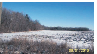
SUPERB LOCATION - CLOSE TO TOWN! $274,000 Anna Lostritto* 10-004-VL W1765092