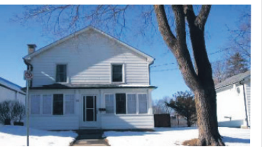
TIME FOR NEXT GENERATION $299,900 PresswoodTeam.com 10-087-30 W179699