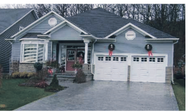
EXEC. BUNGALOW BACKING ONTO GREENBELT $525,500 PresswoodTeam.com 09-499-91 X1788672