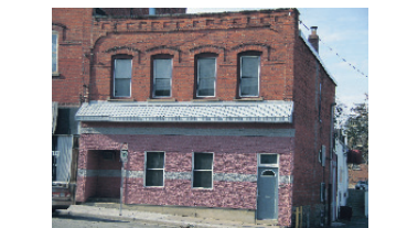
INVESTMENT OPPORTUNITY $479,900 PresswoodTeam.com 09-463-30 W1731126