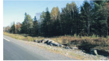
.71 ACRE LOT ON PAVED ROAD $69,900 Marilyn Kerr* 09-471-VL X1774162