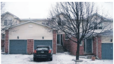
PERFECT HOME FOR FIRST TIME BUYERS $239,900 PresswoodTeam.com* 10-079-30 W1793880