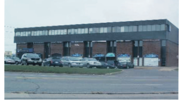
OFFICE SPACE FOR LEASE - GREAT LOCATION! $1,000/Month PresswoodTeam.com 09-118-30 W1704475