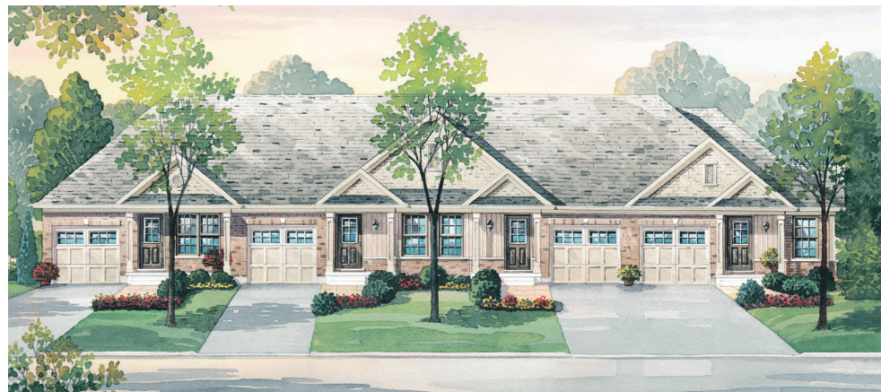
Arbour Lane's homes are very tasteful looking elevations with classic detailing and durable finishes.

Arbour Lane's homes are very tasteful looking elevations with classic detailing and durable finishes. Premium, long-lasting shingles, easy-maintenance Low-E Argon windows, alumi-