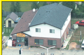
WORK AND LIVE FOR ONE LOW PRICE $399,900

Get the Most Experience Working For You.