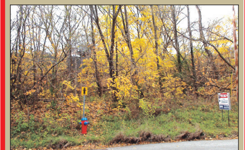
PRIME DOWNTOWN GEORGETOWN LOCATION 3 building lots, side by side, ready to be developed. Call Peter* for further information.

Gorgeous bungalow with 3 car garage on park-like property for someone looking for peace and privacy in the exclusive St. Georges Estates! Beautifully decorated in modern tones and exquisitely appointed with amazing attention to detail. Features plaster crown mouldings, hardwood floors, upgraded trim, 9' smooth ceilings on main level & tons of pot lights both on the main floor and in the open concept finished basement that doubles the living space of this home. Lovely kitchen has granite countertops, built-in appliances, and garden door walkout to concrete patio, pond, inground sprinkler system & gardens galore...all with a picture perfect backdrop of trees and open fields. Your very own piece of paradise. Martha Stewart lives here- Immaculate top to bottom!