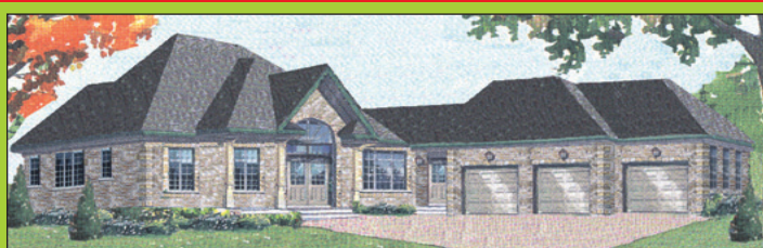
LUXURY BUNGALOW ON 10 ACRE WOODED LOT $888,000!!

2800 sq. ft. with oversized triple car garage plus 1/2 garage for tractor storage etc. Cathedral ceiling in family room, 9' ceilings on main floor & walkout basement with 2 separate entrances into basement, solid maple or oak kitchen cabinets & bathroom vanities, granite countertops, and a lot more. Select your dream colours and move in this summer. For full details call Peter*.