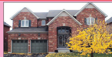
28 GRIST MILL DRIVE $567,000

2800 sq. ft. with oversized triple car garage plus 1/2 garage for tractor storage etc. Cathedral ceiling in family room, 9' ceilings on main floor & walkout basement with 2 separate entrances into basement, solid maple or oak kitchen cabinets & bathroom vanities, granite countertops, and a lot more. Select your dream colours and move in this summer. For full details call Peter*.