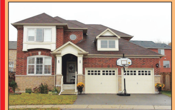
38 APPLE BLOSSOM $539,900

Get the Most Experience Working For You.