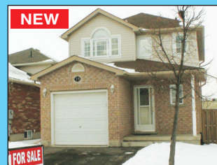
38 BEARDMORE CRESCENT $316,900