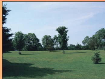
PARK-LIKE 2.74 ACRES $699,900!!

Stunning, all brick, custom home featuring a modern open concept design & a unique blend of elegance and country charm. Beautifully decorated & recently improved with richly stained walnut floors, ceramics & lovely new trim & baseboards. Impressive great room with floor-to-cathedral ceiling brick fireplace. Full 1 bdrm inlaw suite beautifully done with games room, living room with stone fireplace and lots of pot lights. Detached dbl car garage plus a fantastic workshop (30'x55') with heat, hydro, water, 14' ceiling, 2 truck doors & mezzanine. Great location - just 20 min. to Georgetown GO. Call for full details.