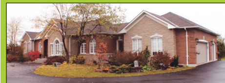
2 ACRES IN ESTATE SUBDIVISION - BACKS ONTO TREES AND GREENLAND $879,900

gas station, variety store with lotto centre, restaurant and a 3 bedroom home to live in while you work. The one level home features 3 good sized bedrooms, large living/dining combination, massive kitchen, laundry & 4 pc bath. 2300 sq. ft. commercial zoning and 1300 sq. ft. residential zoning. Set on a double lot with full town services. Located at 401 & exit #29 (Drumbo). Your one stop deal. Call us for the unbelievable details.