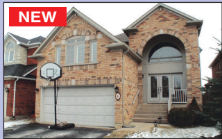
4 MAY STREET $469,900

Over 65 Years Combined Experience ... at Your Service!