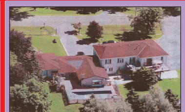
MULTI FAMILY HOME... UNIQUE DESIGN ON 1 ACRE PROPERTY $745,000

Get the Most Experience Working For You.