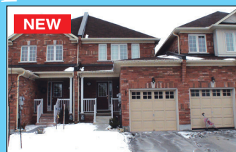
55 MOWAT CRES. $279,900