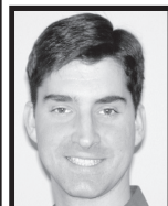
By Cory Soal R.H.A.D.

(Across from the Library and Cultural Centre)