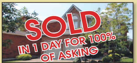
SOLD IN 1 DAY FOR 100% OF ASKING Breathtaking design. Superb 4+1 bedroom & 3 bath w/incredible kitchen, family room, sep living room & dining room, fabulous hardwood floors. 2365 sq. ft. + stunning finished basement. Beautifully landscaped front & back. ENORMOUS backyard.