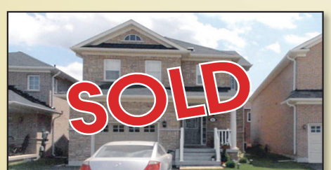
STUNNING!!! Georgetown South. 3 large bedrooms, 3 baths, open concept design w/breathtaking cathedral ceiling. Quiet family area, walk to schools and shops. Fantastic upgraded kitchen. Landscaped to perfection on pie-shaped lot.