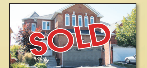
SOLD Gorgeous 4 Bedroom Home on a quiet street in Georgetown South. Ravine lot, 4 large bedrooms, 4 baths, W/O basement, beautiful kitchen w/granite countertops, 2 walk in closets in master, vaulted ceiling, fully landscaped backyard with inground pool. Many more great features.