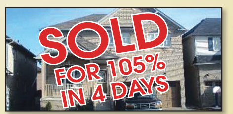
SOLD FOR 105% IN 4 DAYS Superb Value on Quiet Crescent-Brampton West. 9 ft. ceilings, crown moulding, open concept. Master has FULL ensuite, massive family room, huge deck, 4 large bedrooms, 3 baths, beautiful chandelier, unspoiled basement. Call The BEZT Team for info to-day. MLS# W1719631