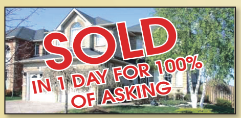
SOLD IN 1 DAY FOR 100% OF ASKING Stunning Home With Every Imaginable Upgrade. 2 skylights, roman columns, gorgeous custom kitchen, ceramics from foyer thru to kit, rest of main floor hardwood, main floor office, prof. landscaped, pot lights, open staircase, Calif. shutters & much more.