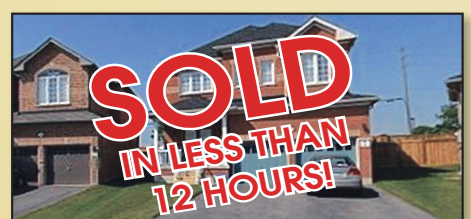
SOLD IN LESS THAN 12 HOURS! Classic Beauty with all the bells and whistles. 4 large bedrooms, 3 baths. Huge pie-shaped lot with no houses behind. Gorgeous maple staircase with cast iron spindles.