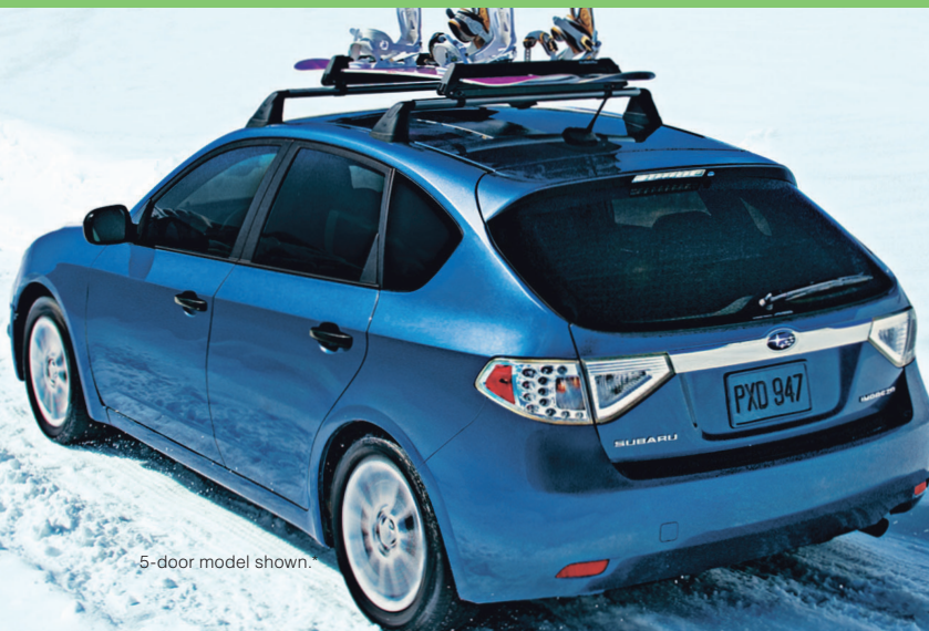
5-door model shown.

Automobile Journalists Association of Canada Association des Journalistes Automobiles du Canada Best New Canadian Utility Car of the Year: 2010 Outback