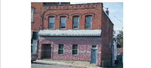
INVESTMENT OPPORTUNITY $479,900 PresswoodTeam.com 09-463-30 W1753126