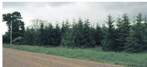
BUILD YOUR DREAM HOME - BEAUTIFUL 1.4 ACRES $185,000 Suzanne Lawrence* 08-398-VL X1753604