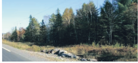
.71 ACRE LOT ON PAVED ROAD $69,900 Marilyn Kerr* 09-471-VL X1774162