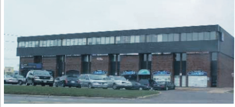
OFFICE SPACE FOR LEASE - GREAT LOCATION! $1,000/Month PresswoodTeam.com 09-118-30 W1704475