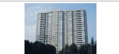
LOOKING FOR A CONDO? $205,000 PresswoodTeam.com 09-442-19 W1719121