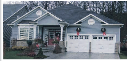
EXEC. BUNGALOW BACKING ONTO GREENBELT $525,500 PresswoodTeam.com 09-499-91 X1746872