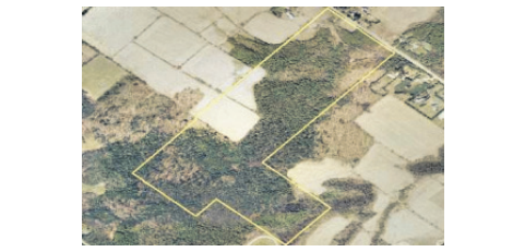
94 ACRES OF PRIME LAND $499,000 David Burland* 07-636-VL W1749927