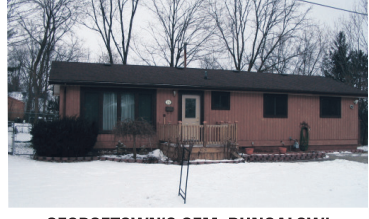
GEORGETOWN'S GEM, BUNGALOW! $349,900 10-036-30 W1779721 PresswoodTeam.com