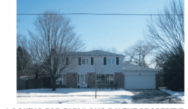
LOOKING FOR FABULOUS RAVINE PROPERTY? $569,900 New Exclusive Jill Johnson*