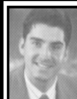
By Cory Soal R.H.A.D.

FOR EMERGENCIES - FIRE/POLICE/AMBULANCE: DIAL 9-1-1